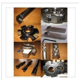
CNC Machine Tools