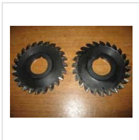
Carbide Tipped Side & Face Cutter