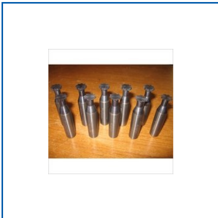
SOLID CARBIDE T SLOT CUTTER

Blade Dresser, Boring Bar, Burnish Drill, CNC Cutting Tool, CNC Drill, CNC Machine Tools, Carbide Drill, Carbide Inserts, Carbide Router Bits, Carbide Slitting Saw, Carbide Step Drill, Carbide Tipped Side & Face Cutter, Carbide Tipped Slitting Saw, Cluster Diamond Dresser, Coated Carbide Router Bit, etc.