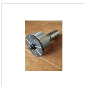
Face Roller Burnish Tool.