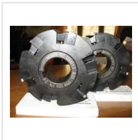
Side And Face Milling Cutter