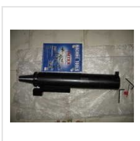
VTL Tool Holder