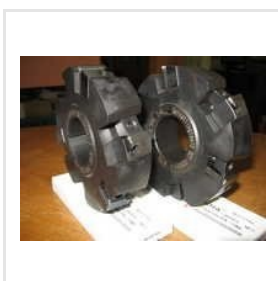
Side And Face Cutter