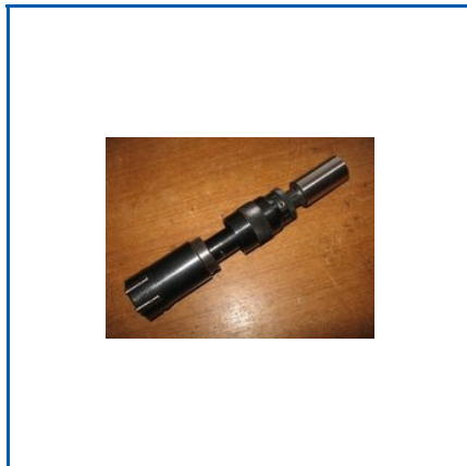
ROLLER BURNISHING TOOL