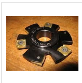
Insert Slitting Saw Cutter