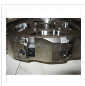
CNC Cutting Tool