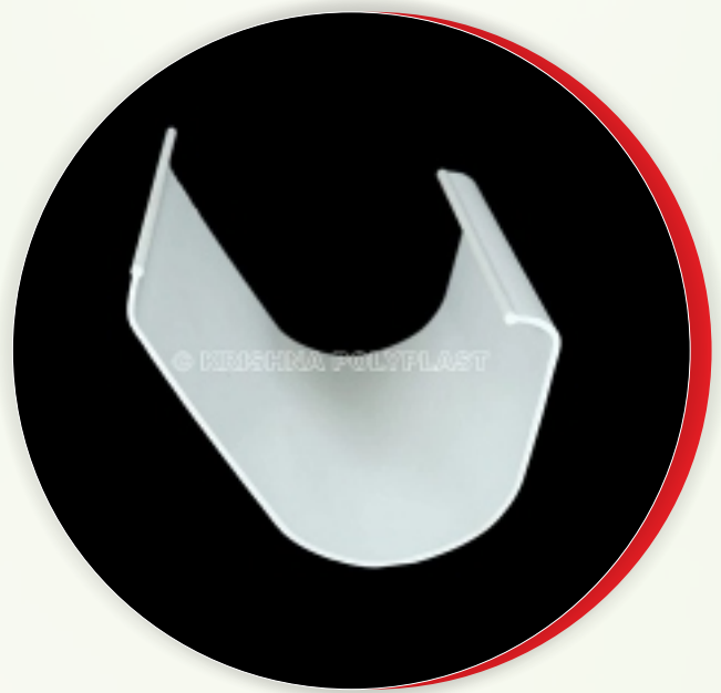
PVC Poultry Equipment