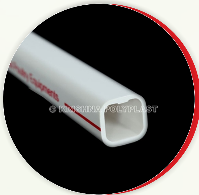
Poultry Square Pipe