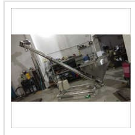
Stainless Steel Screw Conveyors