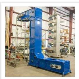
Z Type Bucket Elevators