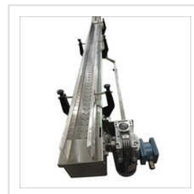
Industrial Chain Conveyor