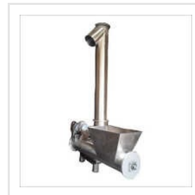
Vertical Screw Conveyor Machines