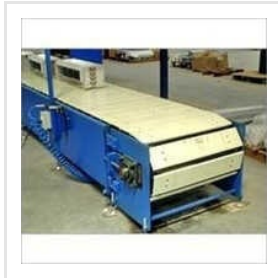
Slat Chain Conveyor