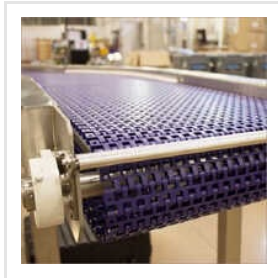
SS Salt Chain Conveyor