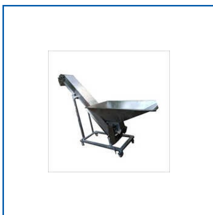
10 FEET PACKING BELT CONVEYOR