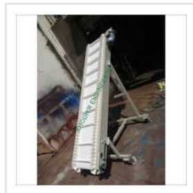
Packing Belt Conveyor