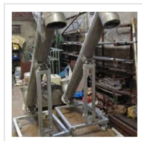
Multi Screw Conveyor