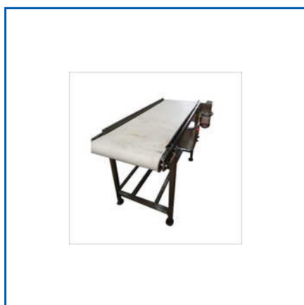
50 FEET WHITE BELT CONVEYOR

10 Feet Packing Belt Conveyor, 20 Feet Goods Handle Belt Conveyor, 30 Feet Foldable Climbing Belt Conveyor, 50 Feet White Belt Conveyor, Goods Handle Belt Conveyor, Industrial Chain Conveyor, Industrial Roller Conveyors, MS Belt Conveyor, Mild Steel Bucket Elevators, Multi Screw Conveyor, Orange Slat Chain Conveyor, Packing Belt Conveyor, SS Electric Roller Conveyors, SS Pouch Conveyor, SS Salt Chain Conveyor, etc.