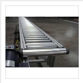
SS Electric Roller Conveyors