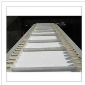
Goods Handle Belt Conveyor