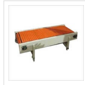
Industrial Roller Conveyors