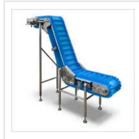
30 Feet Foldable Climbing Belt