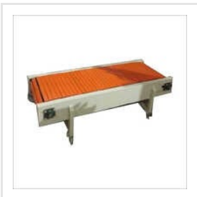
Orange Slat Chain Conveyor