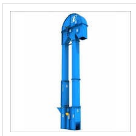
Mild Steel Bucket Elevators