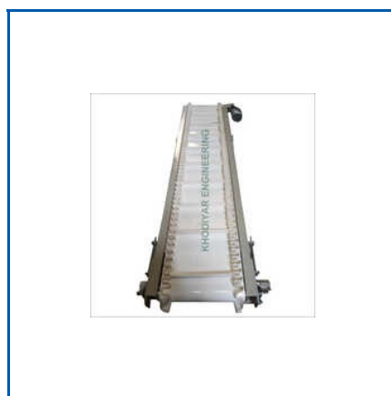
MS BELT CONVEYOR