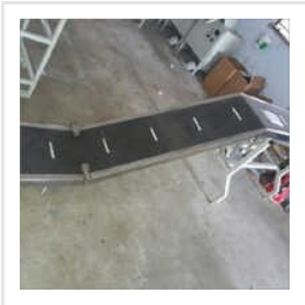
SS Pouch Conveyor