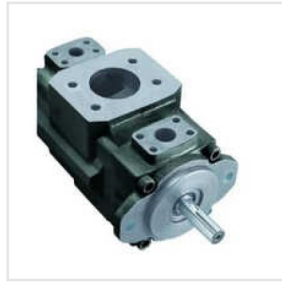
Double Vane Pump