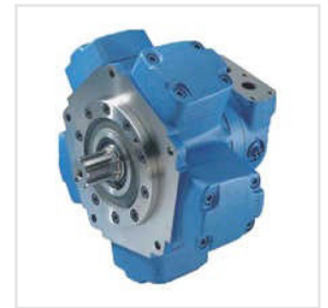
Bosch Rexroth Radial Piston Hydraulic Motor