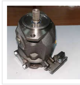
Rexroth Hydraulic Piston Pump A10VSO 28