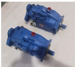
EATON VICKERS HYDRATION PISTON PUMP

350 Bar Oilgear Pump Repair, 3HP Rexroth Hydraulic Pump, 40LPM Rexroth Hydraulic Pump, A10VO60 Rexroth Hydraulic Pump, Atlas Copco Hydraulic Pump, Axial Piston Pump, Bosch Rexroth Radial Piston Hydraulic Motor, Danfoss Hydration Pump, Danfoss Hydraulic Pump Repairing Service, Danfoss Omt 400 Hydraulic Motor, Direction Control Valve, etc.