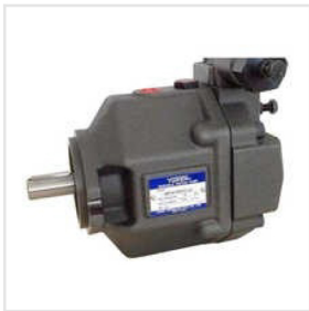
Yuken Hydraulic Piston Pump