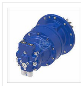
Rexroth Swing Drive Motor