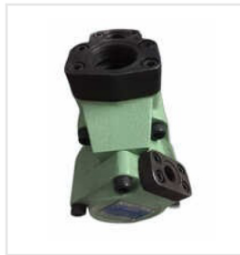
Yuken Vane Pump