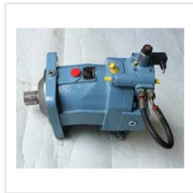
Rexroth Hydraulic Pump