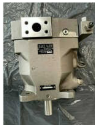
PV092 PARKER HYDRAULIC PUMP