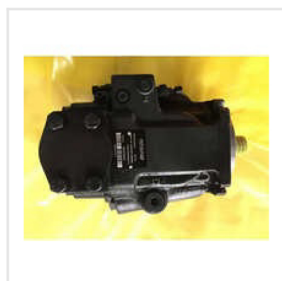
Danfoss Hydraulic Pump Repairing