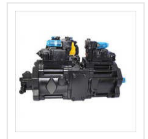
Excavator Hydraulic Pump