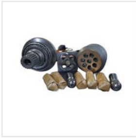
Eaton Hydraulic Pump