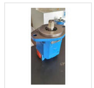
Permco Hydraulic Gear Pumps