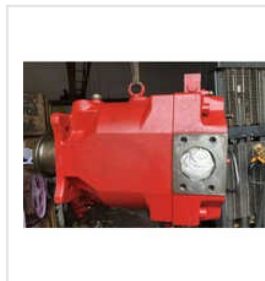
Parker Axial Piston Pump Repairing