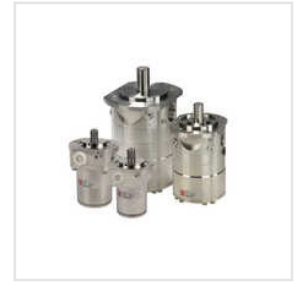
Rexroth Hydraulic Piston Pump