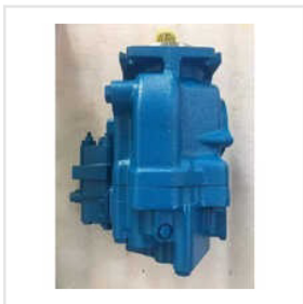
Yuken Hydraulic Vane Pump