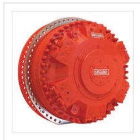
Hagglunds Radial Piston Hydraulic Motor