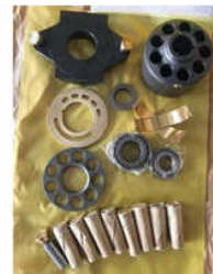
A10VSO PUMP SPARE PARTS