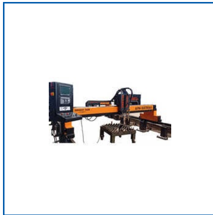
MEDIUM DUTY CNC CUTTING MACHINE