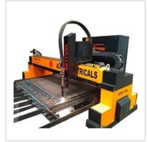
CNC Profile Cutting Machine