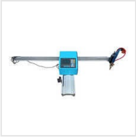
Portable CNC Cutting Machine