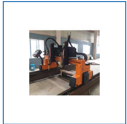
CNC BEAM CUTTING MACHINE