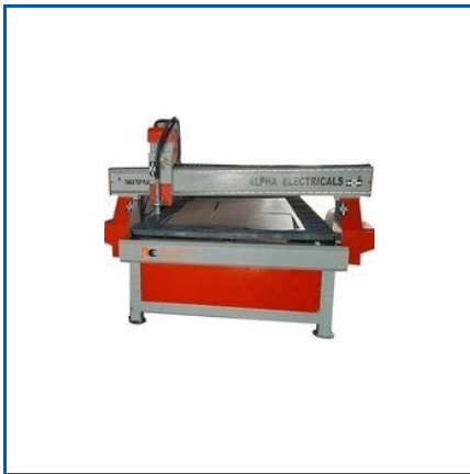
TABLE TOP CNC CUTTING MACHINE

CNC Beam Cutting Machine, CNC Plasma Gas Cutting Machine, CNC Profile Cutting Machine, Dual Gas Torch CNC Profile Cutting Machine, Medium Duty CNC Cutting Machine, Portable CNC Cutting Machine, Table Top CNC Cutting Machine, etc.