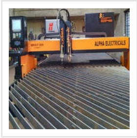
CNC Plasma Gas Cutting Machine