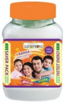
600 Gm Orange Nagpuri Glucose Powder