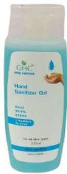
250 MI Hand Sanitizer Gel