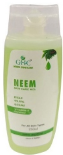
250 ML Neem Hand Sanitizer Gel