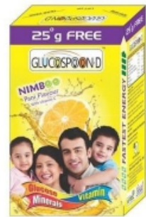
100 Gm Nimbu Pani Glucose Powder