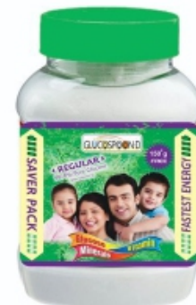
600 Gm Regular Glucose Powder