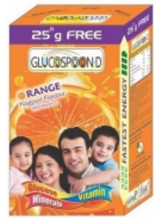
100 Gm Orange Nagpuri Glucose Powder