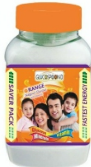
1 Kg Orange Nagpuri Glucose Powder