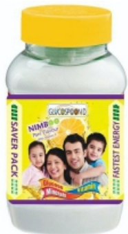
1 Kg Nimbu Pani Glucose Powder