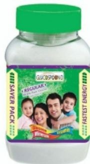
1 Kg Regular Glucose Powder