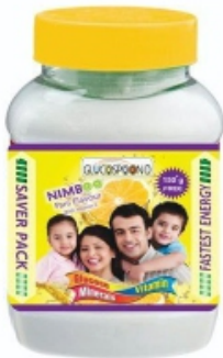
600 Gm Nimbu Pani Glucose Powder