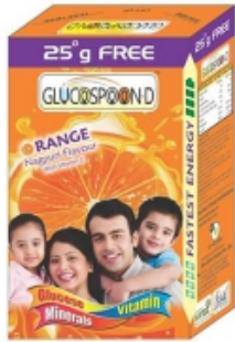
Orange Flavour With Vitamin C Glucose Powder