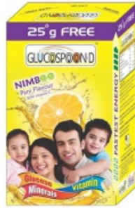
Lemon Flavour With Vitamin C Glucose Powder