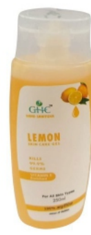
250 ML Lemon Hand Sanitizer Gel