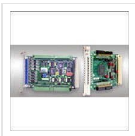
Electrical And Electronics