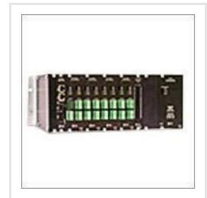
Modular Rack System