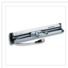
PBS Self Aligned System