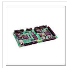
Programmable Multi Axis Controller