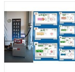
MAC 26 TOOL REGRINDING MACHINE