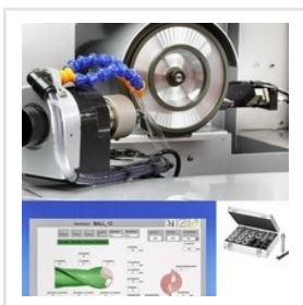
MAC26 CNC Tool Grinding Machine