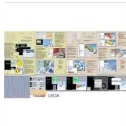
CNC TOOL GRINDING SOFTWARE