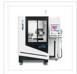
Halller M1 Num Control