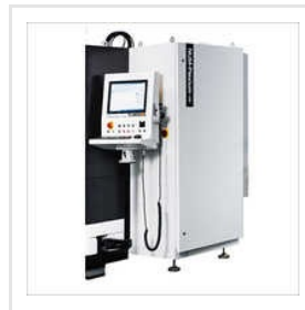
Reliably Stable Control System