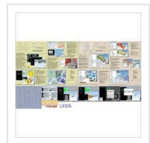
Tool And Cutter Grinding Software