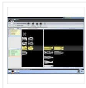
Tool Grinding Software