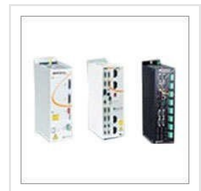
Integrated Controller Amplifiers