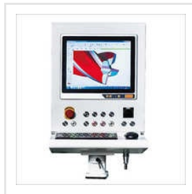
Utility Control Panel