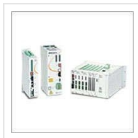
MACRO Ring Products