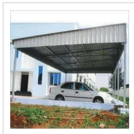
Industrial Car Parking Shed