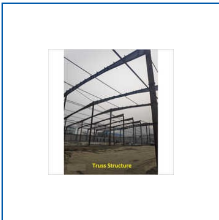
METAL ROOF TRUSS