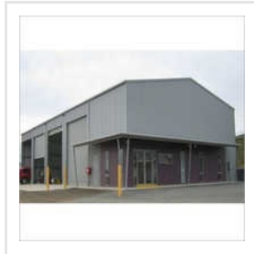
Pre Engineered Mild Steel Structure