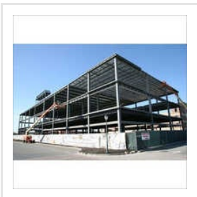
Mild Steel Prefabricated Factory