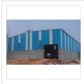
Pre Engineered Factory Building