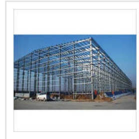
Pre Engineered Godown Structure