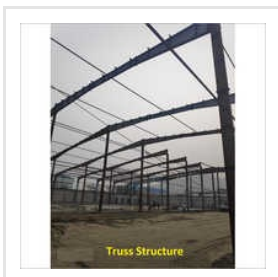
Metal Roof Truss