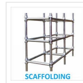
Steel Scaffolding Structure