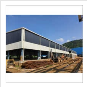
Pre Engineered Mild Steel Building