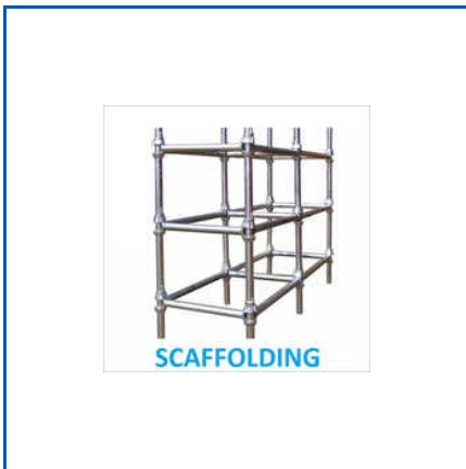
STEEL SCAFFOLDING STRUCTURE

Building Truss Structure, Commercial Prefabricated Structures, Industrial Car Parking Shed, Industrial Pre Engineered Building, Metal Roof Truss, Mild Steel Industrial Shed, Mild Steel Prefabricated Factory Shed, Pre Engineered Factory Building, Pre Engineered Godown Structure, Pre Engineered Mild Steel Building, Pre Engineered Mild Steel Structure, Steel Girder Bridges, Steel Scaffolding Structure, Warehouse Prefabricated Structure, Warehouse Sheds, etc.