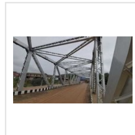
Steel Girder Bridges