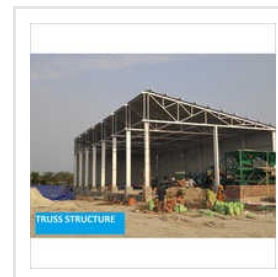
Building Truss Structure