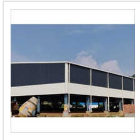
Industrial Pre Engineered Building