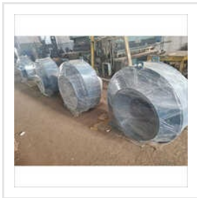
DC Motor Cooling Blower