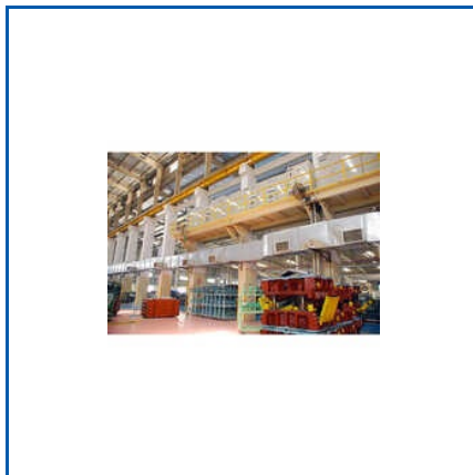
AIR COOLING WITH DUCTING