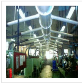
Fume Exhaust And Pollution Control