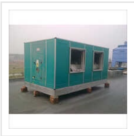
Airwasher Double Skin