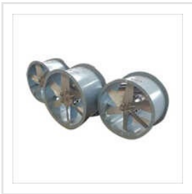
Commercial Axial Flow Fans