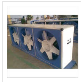
Axial Flow Fire Exhaust Fan