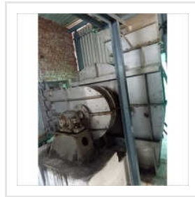
High Pressure Blower