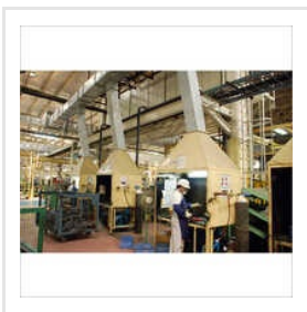
Fume Exhaust System For Weld Station