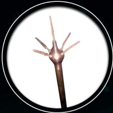
FLUIDYNE LIGHTNING ARRESTER

NCR ENTERPRISES Unparalleled quality products are all that we serve!