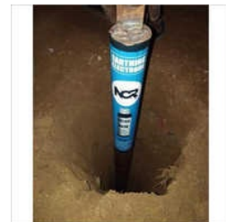
COPPER PIPE EARTHING