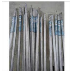
GI CHEMICAL EARTHING