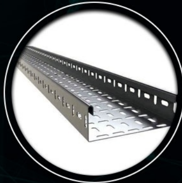
GP CABLE TRAY