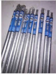
GI Earthing Electrode