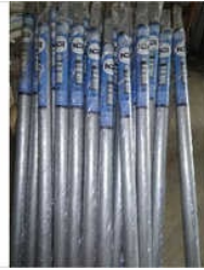
High Performance Earthing Electrode