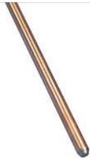
Copper Grounding Rod