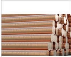
Solid Copper Earthing Rod