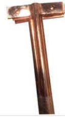
Copper Bonded Earthing Rod