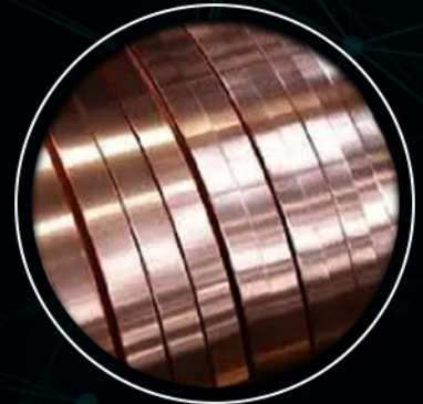
COPPER EARTHING STRIPS

Earthing Electrode, GI Earthing Electrode, Copper Bonded Earthing Electrode, Back Fill Chemical Compound, Cable Tray, Chemical Copper Earthing Electrode, Chemical Earthing Electrode, Copper Bonded Earthing Plate, Copper Bonded Earthing Rod, etc.