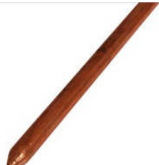
Copper Earthing Rod