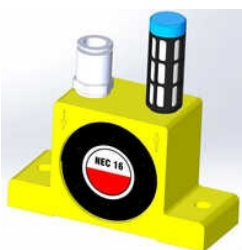
Gt36 Turbine Vibrator