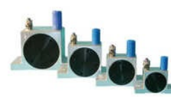
Pneumatic Turbine Vibrators