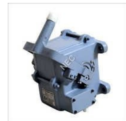
FLAMEPROOF ELECTROMAGNETIC HAMMER