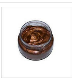
Anti Seize Assembly Compound