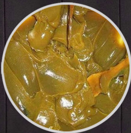
Metal Free Anti Seize Compound