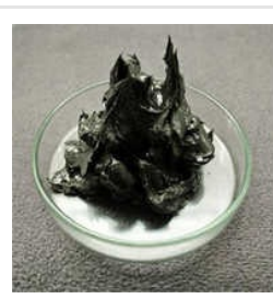
High Temperature Lubricant Oil