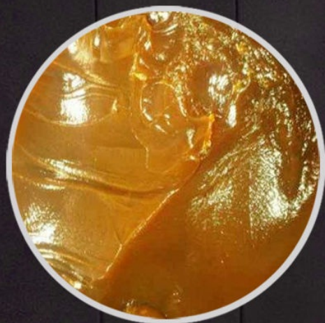
High Speed Grease