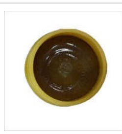
Synthetic Non Melt Grease