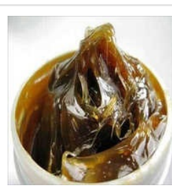
Heavy Duty Gear Grease