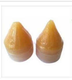
Synthetic Gel Grease