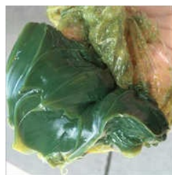
Metal Free Anti Seize Compound