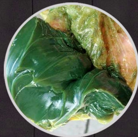
Moly Anti Seize Compound Grease

Aerosol Lubricant Spray, Anti Seize Assembly Compound, Anti Seize Assembly Paste, Anti Seize Paste, Automotive Gear Oil, Automotive Grease, Automotive Hydraulic Fluids, Automotive Hydraulic Oils, Automotive Oil Lubricants, Automotive Synthetic Engine Oils, Automotive Synthetic Lubricants Oil, Conductive Grease, Conformal Coating Spray, Copper Based Anti Seize Compound, Di Methyl Silicone Fluids, etc.