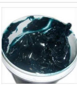
Heavy Duty Nonmelting Grease