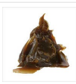
Heavy Duty Moly Grease