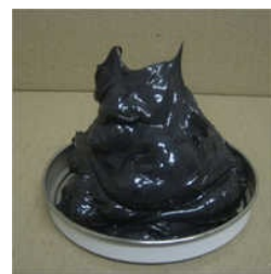
Anti Seize Assembly Paste