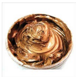
ANTI SEIZE PASTE

Aerosol Lubricant Spray, Anti Seize Assembly Compound, Anti Seize Assembly Paste, Anti Seize Paste, Automotive Gear Oil, Automotive Grease, Automotive Hydraulic Fluids, Automotive Hydraulic Oils, Automotive Oil Lubricants, Automotive Synthetic Engine Oils, Automotive Synthetic Lubricants Oil, Conductive Grease, Conformal Coating Spray, Copper Based Anti Seize Compound, Di Methyl Silicone Fluids, etc.