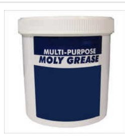
High Temperature Moly Grease