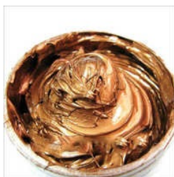
Thread Doping Compounds