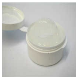
SILICONE VACUUM COMPOUND