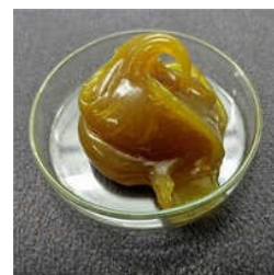
COPPER BASED ANTI SEIZE COMPOUND