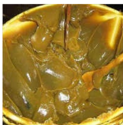
Moly Anti Seize Compound Grease