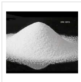
EDTA Zinc Powder