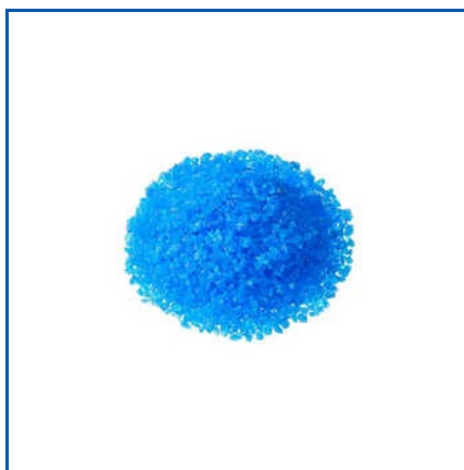
50 KG COPPER SULPHATE