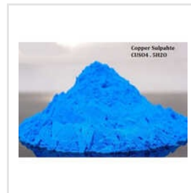
Copper Sulphate Powder