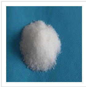
Zinc Sulphate Heptahydrate For