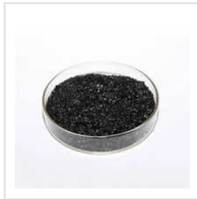
98% Potassium Humate Shiny Flakes