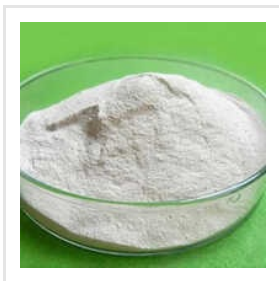
Ferrous Sulphate Monohydrate Powder