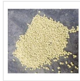
Mix Micronutrient Fertilizers