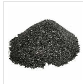
Humic Acid Powder