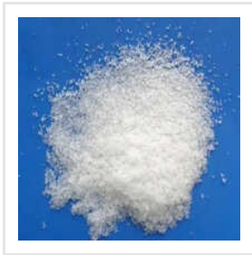
White Magnesium Sulphate