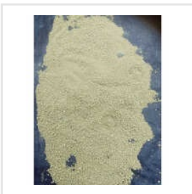
Mix Micronutrient Granular