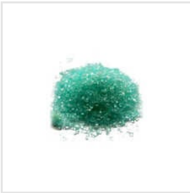
Ferrous Sulphate Crystal