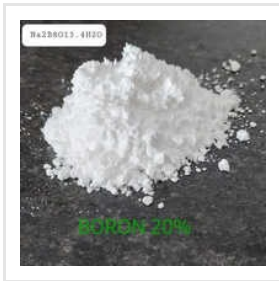
20% Boron Powder