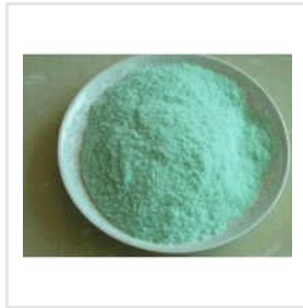
Ferrous Sulphate Heptahydrate