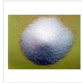
33% Zinc Sulphate Monohydrate