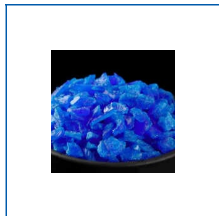
BLUE COPPER SULPHATE