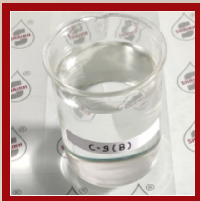
Solvent C9 White