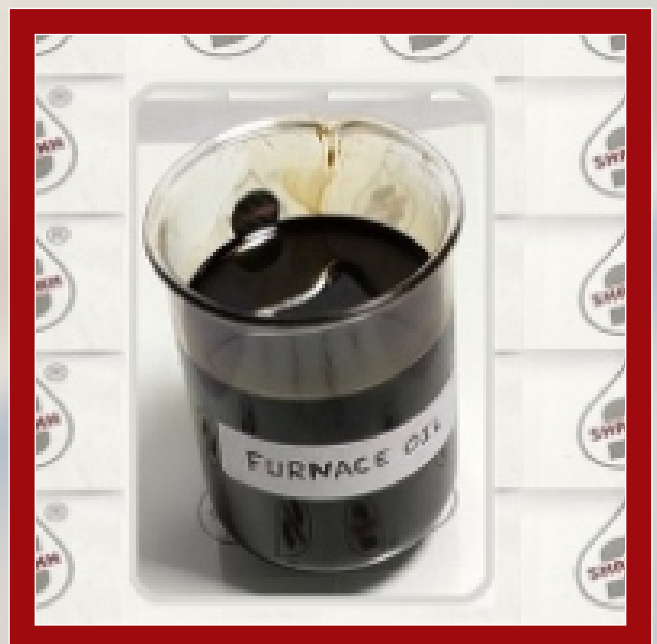
Imported Furnace Oil Cst 180