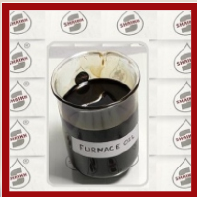
Furnace Oil 180