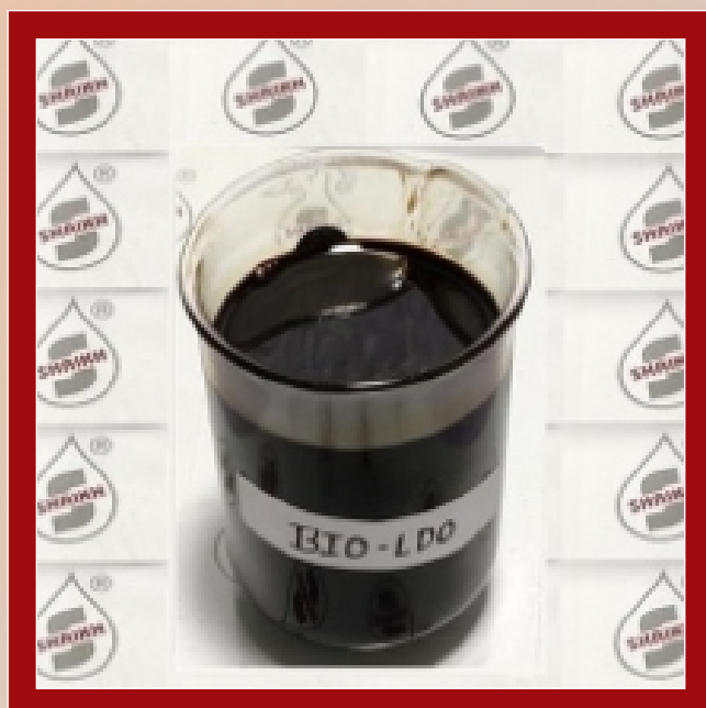
Tyre Pyrolysis Fuel Oil