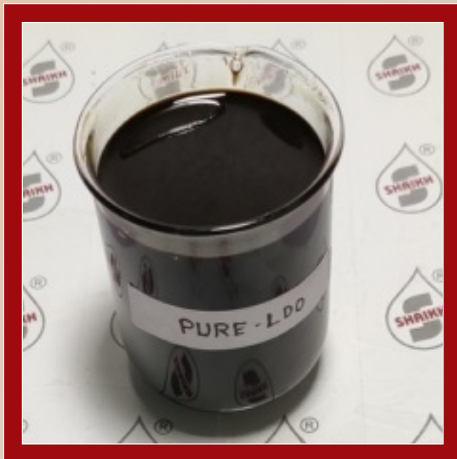
Light Diesel Oil