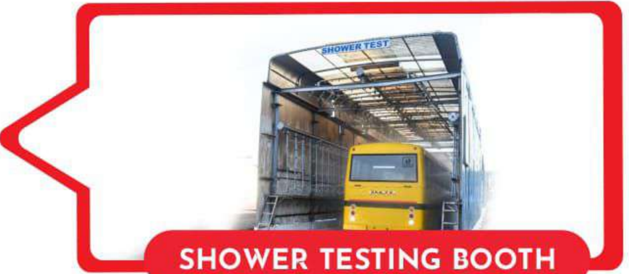
SHOWER TESTING BOOTH