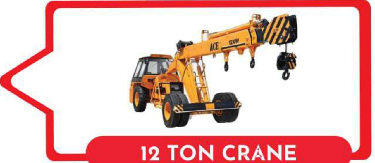
12 TON CRANE