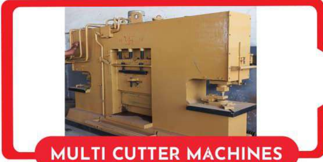
MULTI CUTTER MACHINES