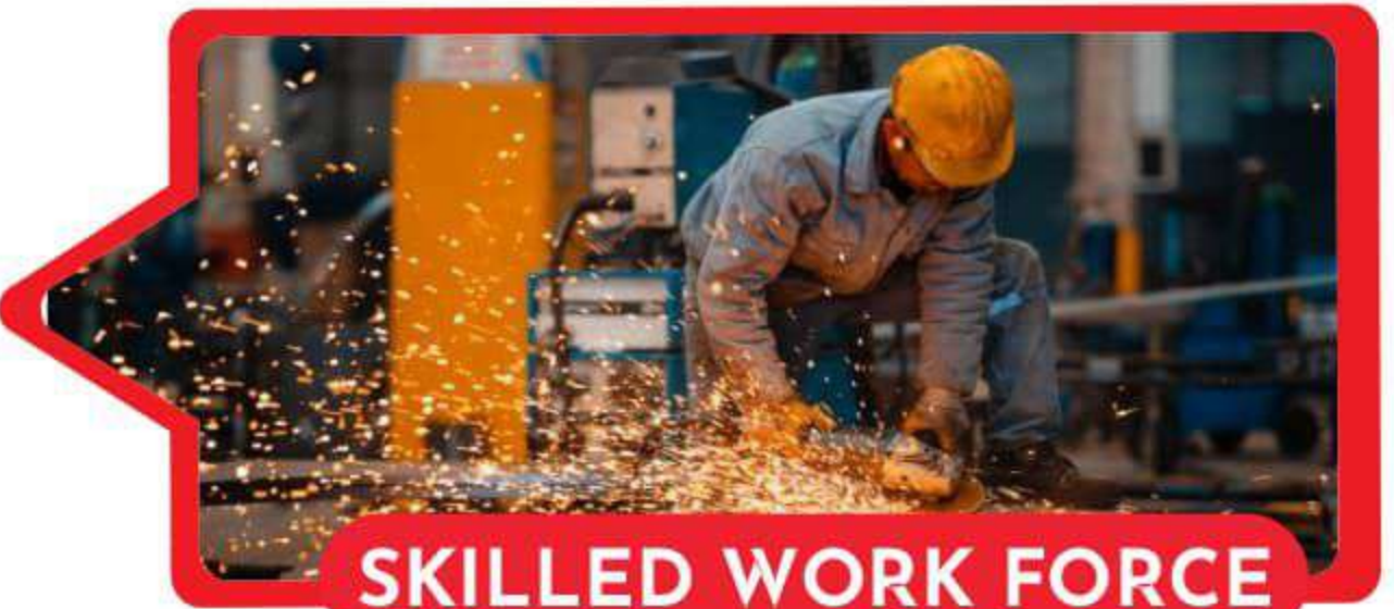
SKILLED WORK FORCE