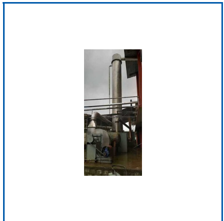
SHELL AND TUBE CONDENSER