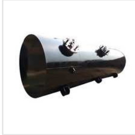
Diesel Fuel Tank