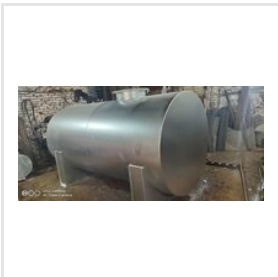
Chemical Storage Tank