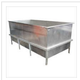
SS Storage Tank