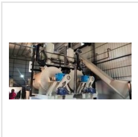
Chicken Waste Rendering Plant