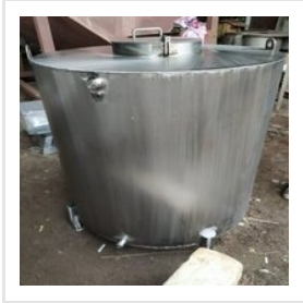
Stainless Steel Storage Tank