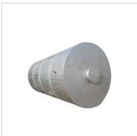
MS Tallow Storage Tank