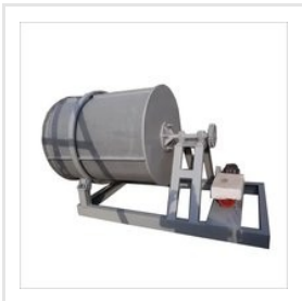
Solid Separator Machine