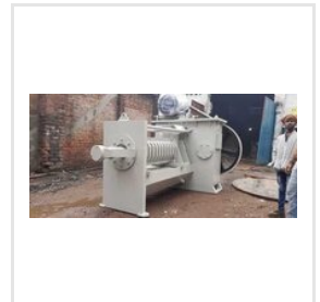
Automatic Screw Press