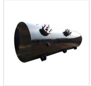
Diesel Fuel Tanks