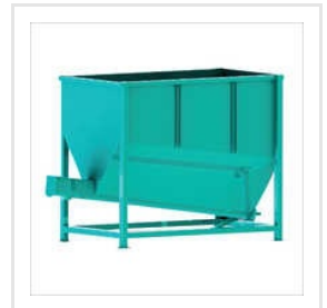
MS Raw Material Bin