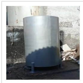
Vertical Storage Tank