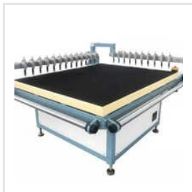
Multi Head Manual Glass Cutting Machine