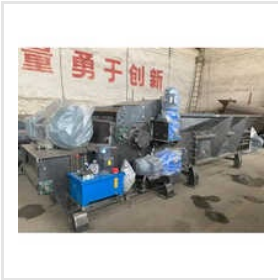
Industrial Wood Crusher Machine