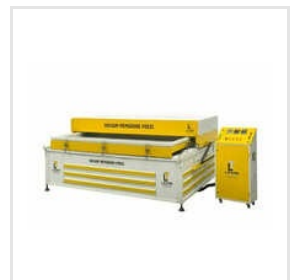
Industrial Vacuum Membrane Press