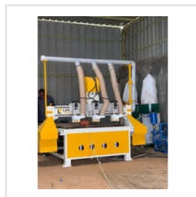
CNC 3 Head Table Cutting Machine