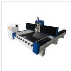
Double Head CNC Router Machine