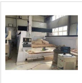
Industrial CNC Pattern Making Machine