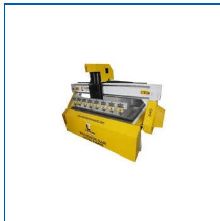
CNC MULTI HEAD GLASS CUTTING MACHINE