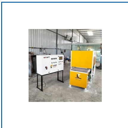
TOUGHENED GLASS CUTTING MACHINE

100 Ton Hydraulic Cold Press Machine, 1325 CNC Stone Router Machine, CNC 3 Head Table Cutting Machine, CNC Glass Cutting Machine, CNC Multi Head Glass Cutting Machine, CNC Thermocol Cutting Machine, Double Head CNC Router Machine, Industrial CNC Drilling And Milling Machine, etc.