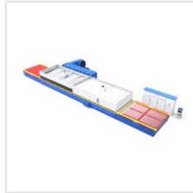
Industrial Glass Tempering Furnace