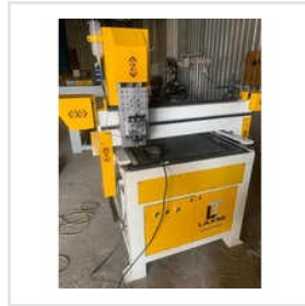
Mini CNC Glass Cutting Machine