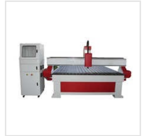
Industrial CNC Drilling And Milling Machine