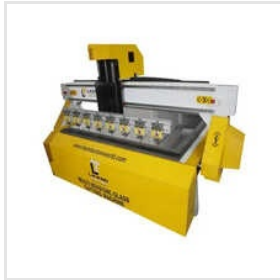
CNC Multi Head Glass Cutting Machine