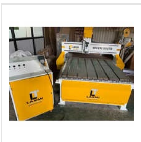
Mini CNC Router Machine