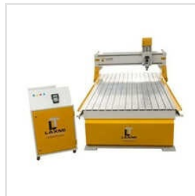
CNC Thermocol Cutting Machine