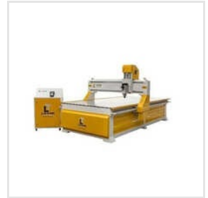
1325 CNC Stone Router Machine