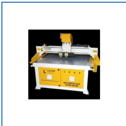
CNC GLASS CUTTING MACHINE