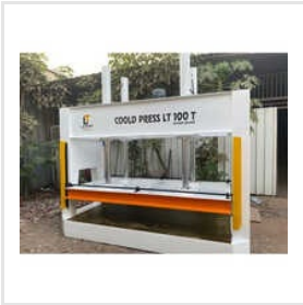
100 Ton Hydraulic Cold Press Machine