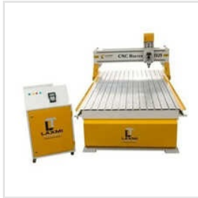
Industrial CNC Wood Cutting Machine