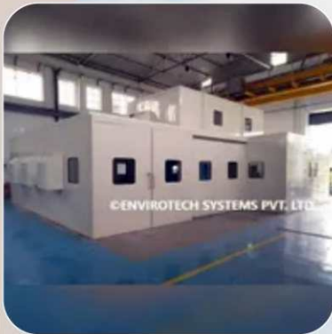
Acoustical Enclosure For Punch Press