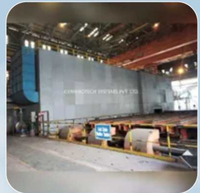
Acoustic Enclosure for Machines