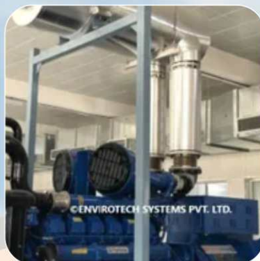
Acoustic Treatment for DG Rooms