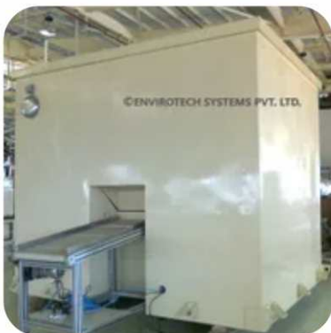
Noise Test Booth