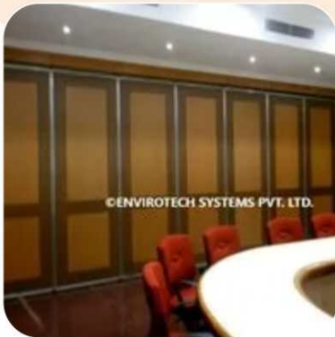
Acoustic Sliding Folding Partition