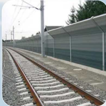
Noise Barrier For Railway