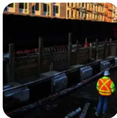
Construction Site Noise Barrier