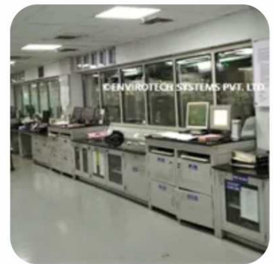
Metal Frame Acoustic Window