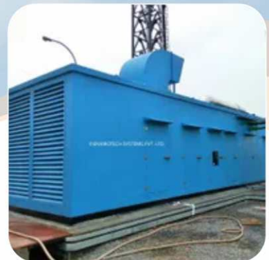
Acoustic Enclosures for DG Set