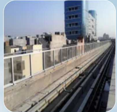
Noise Barrier For Metro