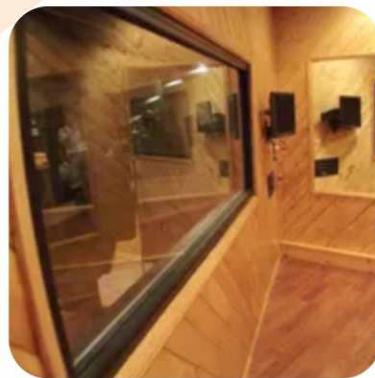
Wooden Frame Acoustic Window