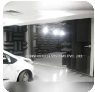
Semi Anechoic Chambers