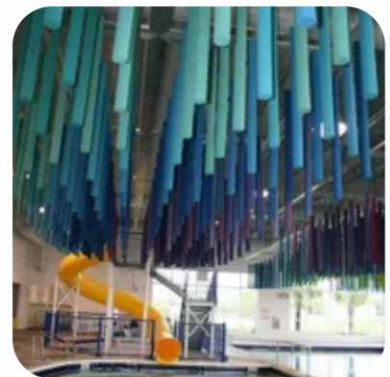
Acoustic Hanging Baffles