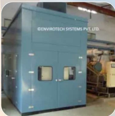
Generator Acoustic Enclosure