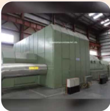
Acoustic Enclosure for Turbine