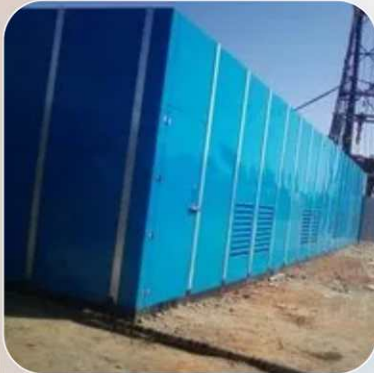
Metallic Noise Barrier