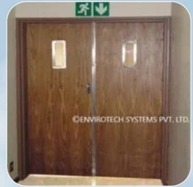
Wooden Acoustic Door