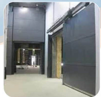
Acoustic Sliding Doors