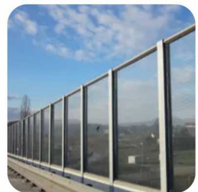
Polycarbonate / PMMA Noise Barrier