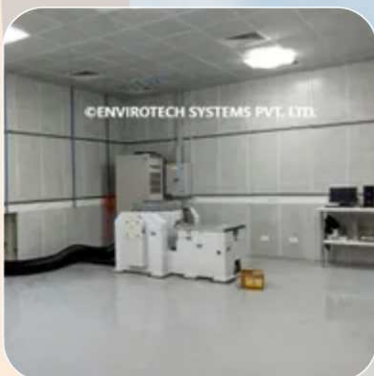
Acoustic Treatment for Engine Test Cell