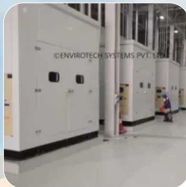
Acoustic Enclosure for Compressor