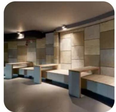
Wooden Wall Panel