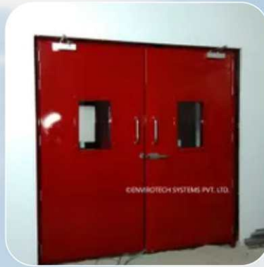
Metal Fire Door