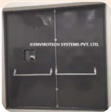
Acoustic Fire Doors