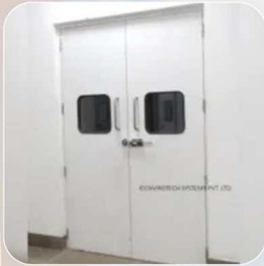
Steel Acoustic Door