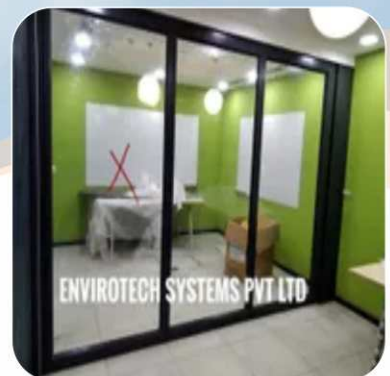
Glass Sliding Folding Partition