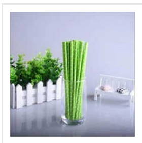
Green Paper Drinking Straw