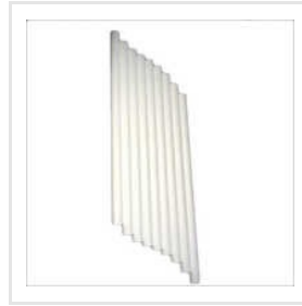
White Paper Drinking Straw