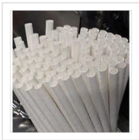
White Paper Straw