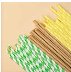
BIODEGRADABLE PRINTED PAPER STRAW

10mm Paper Drinking Straw, Biodegradable Paper Straw, Biodegradable Printed Paper Straw, Black Paper Drinking Straw, Brown Cardboard Paper Coffee Cups, Brown Paper Food Bag, Brown Paper Shopping Bag, Coffee Packaging Mockup Coffee Cup, Colorful Paper Straw, Disposable Paper Cups, Disposable Paper Drinking Straw, Disposable Paper Straw, Disposable White Paper Straw, Drinking Paper Straw, Eco Friendly Disposable Glass, etc.