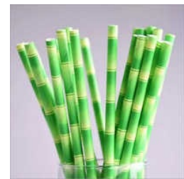
PRINTED PAPER DRINKING STRAW