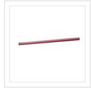
Pink Paper Drinking Straw