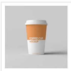
Printed Paper Coffee Cups