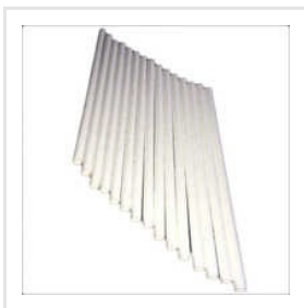
Plain Paper Drinking Straw