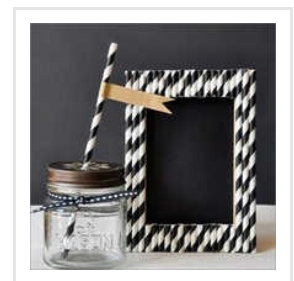
Black Paper Drinking Straw