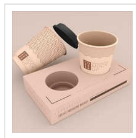
Coffee Packaging Mockup Coffee Cup