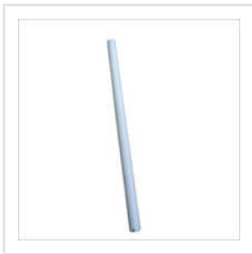
Disposable White Paper Straw