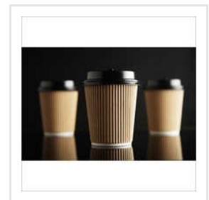
Brown Cardboard Paper Coffee Cups