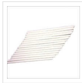
Biodegradable Paper Straw