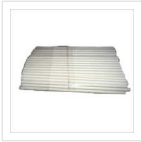
10mm Paper Drinking Straw