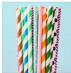
COLORFUL PAPER STRAW