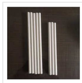
Drinking Paper Straw