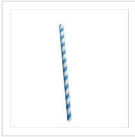
Disposable Paper Straw