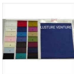
LUSTER VENTURE SHIRTINGS FABRIC

100 Percentage Cotton Checks Fabric, 100* 120 cotton Grey Fabric, 40x60 Cotton Cambric Grey Fabric, 60 Lea Linen Fabric, 60 Lee Linen Cotton, 60*60/92*88 cambric grey cotton, Army Cotton Fabric, Classic Oxford heritage, Cotton Twill Shirting Fabrics, Designer Hot Printed Fabric, Fashion Fewer Shirting Fabric, Giza Cotton Fabric, Green Gold Fabric, Hat Trick Flower Printed White Fabric, Hat Trick Printed White Fabric, etc.