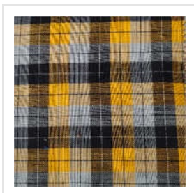
Twill Slub Checks Fabric