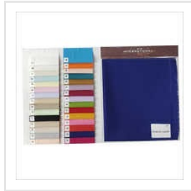
Premium Luxury Fabric