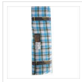
100 Percentage Cotton Checks Fabric