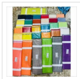
60 Lea Linen Fabric