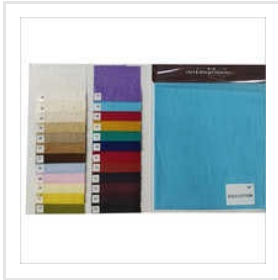
Zolo Cotton Fabric