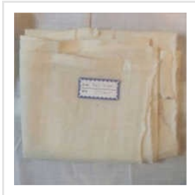
40x60 Cotton Cambric Grey Fabric