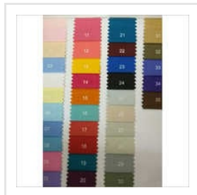
Fashion Fewer Shirting Fabric