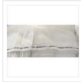
Linen Cotton With Selvedge Fabric