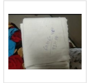
60*60/92*88 Cambric Grey Cotton