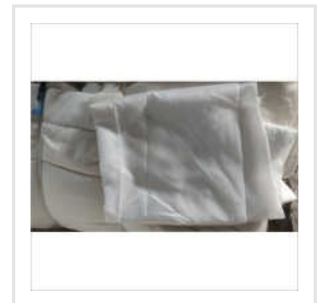
Plain Roto Fabric