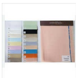
PREMIUM LUXURY SHIRTING FABRICS