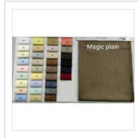
Magic Plain Shirting Fabrics