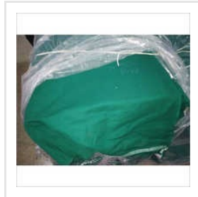
Pure Cotton Green Fabric