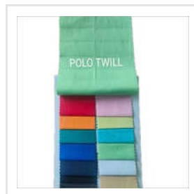
Cotton Twill Shirting Fabrics