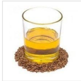
Refined Linseed Oil