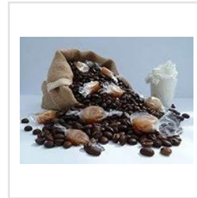
Filter Flavoured Coffee