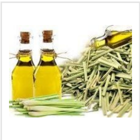
Lemon Grass Oil