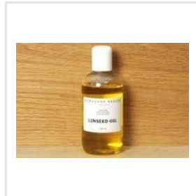
Line Seed Oil