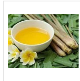
Lemon Grass Oil-A