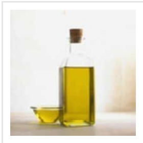
PCM Tops Essential Oil