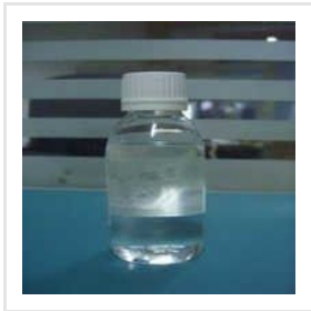
Terpineol MU Oils