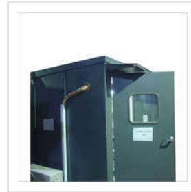
MS Analyzer Shelter