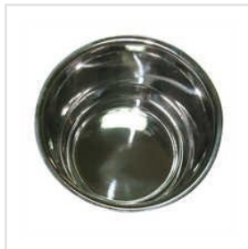
Precision Sheet Metal Components