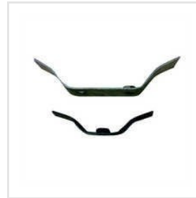
Sheet Metal Part