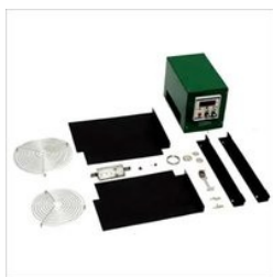
SHEET METAL ELECTRICAL PARTS

Clean Room Equipment Pass Box, Deep Drawn Components, Furnace Roller Bracket, Gantry Cabin, Industrial Aluminum Grating Product, Industrial Boiler Tank, Industrial Cheque Drop Box, Industrial Fire Safe Cage, Industrial Laser Cutting Machine, Industrial Machine Enclosures, Industrial Pharma Conditioning Unit, Industrial Sheet Metal Parts, MS Analyzer Shelter, Modular Portable Cabin, Muffle Furnace, etc.