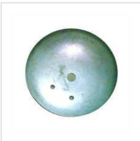
Sheet Metal Components