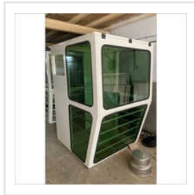
Tower Crane Cabin