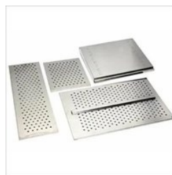
PERFORATED CABLE TRAY