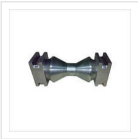
Furnace Roller Bracket