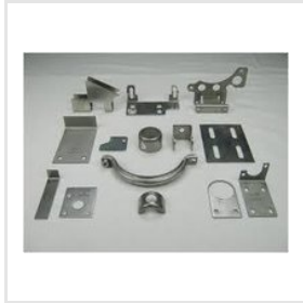
Industrial Sheet Metal Parts