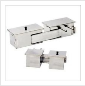
Industrial Boiler Tank