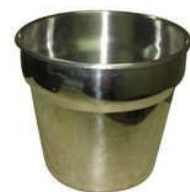
PRECISION SHEET METAL