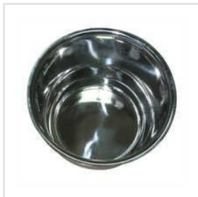
Sheet Metal Pressed Component