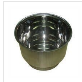
Deep Drawn Components