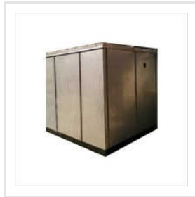
SS Analyzer Shelter