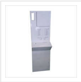
Industrial Cheque Drop Box