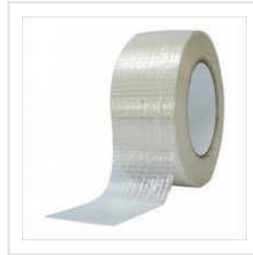
Cross Filament Tape