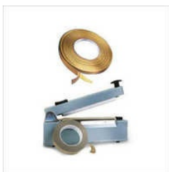
HEAT SEALING TAPES AND GLASS CLOTH TAPE

Abrasive Emery Paper, Aluminium Foil Sealing Joint And Masking Tape, Aluminium Foil Tape Without Liner, Aluminium Foil Tape with Liner, Butyl Foam Die Cut Label, Crepe Paper Masking Tape, Cross Filament Tape, Die Cut Sticker, Double Sided Acrylic Foam Tape, Double Sided Adhesive Tape, Double Sided Avery Scrim Tape, Double Sided Black Tissue Tape, Double Sided Cotton Cloth Tape, Double Sided Scrim Tape, Double Sided Thermally Conductive Tape, etc.