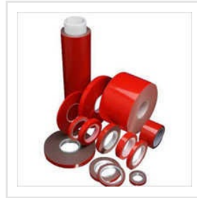
Single Sided Acrylic Foam Tape