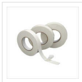
White Tissue Tape