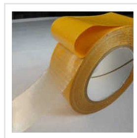
Double Sided Scrim Tape