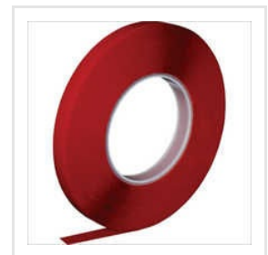
Double Sided Acrylic Foam Tape