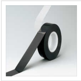
Double Sided Black Tissue Tape