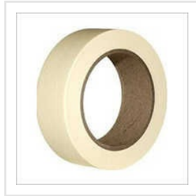
General Purpose BOPP Masking Tape