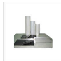
SURFACE PROTECTION TAPE