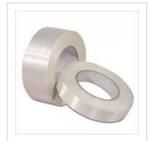
Filament Tapes Roll