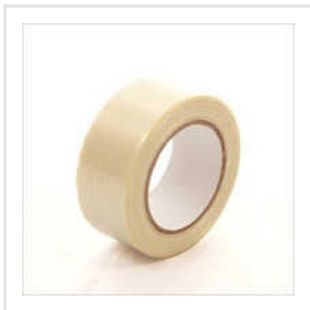
Mono Filament Tape