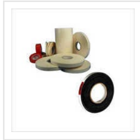
Double Sided Adhesive Tape