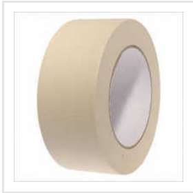
Crepe Paper Masking Tape