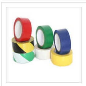
Floor Marking Tape