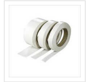
Double Sided White Tissue Tape