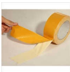
DOUBLE SIDED COTTON CLOTH TAPE