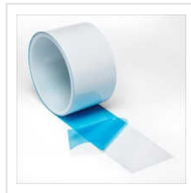
Double Sided Thermally Conductive