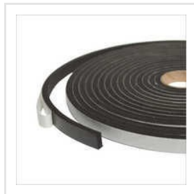
Thermally Conductive Acrylic Foam Tape