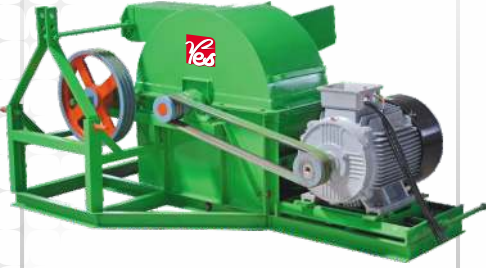
Agri Waste Shredder