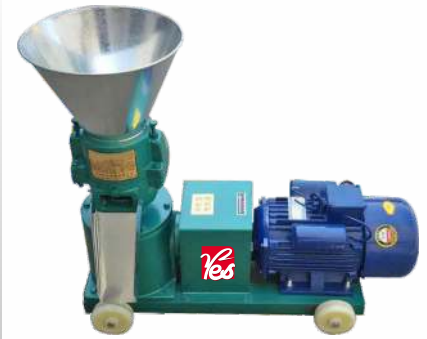
Pellet Making Machine