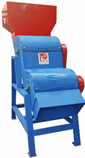
Double Stage Shredder 5 / 10 / 15 HP