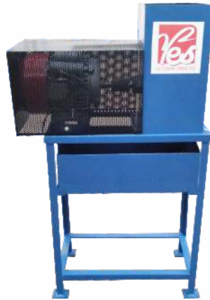
Vegetable Waste Shredder 1 / 2 / 3 / 5 HP