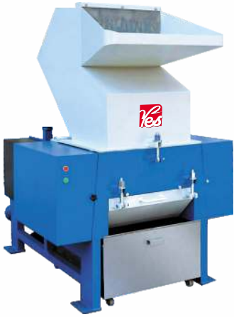
Plastic Waste Shredder (Pet Bottle)