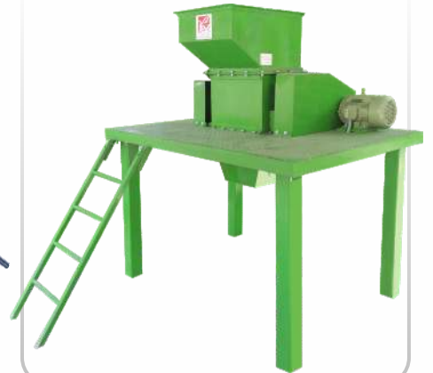
Municipal Park Garden Waste Shredder 5 / 10 HP