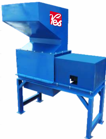
Banana Leaf Waste Shredder 3 / 5 / 10 HP