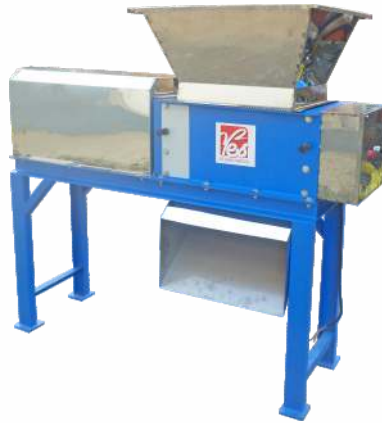
Dual Shaft Shredder (SS) 1 / 2 / 3 / 5 HP