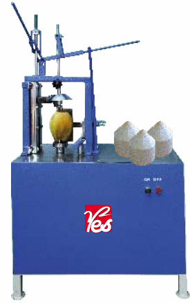
Tender Coconut Trimming Machine