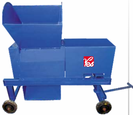
Garden Waste Shredder 3 / 5 / 7.5 / 10 HP