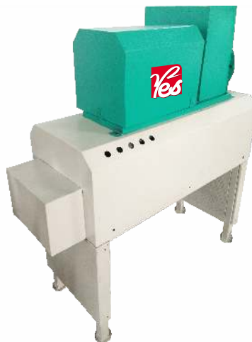
Organic Waste Shredder with Mixer