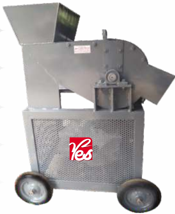
Organic Waste Shredder 3 / 5 / 10 HP