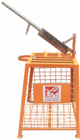
Tender Coconut Punch & Cutting Machine