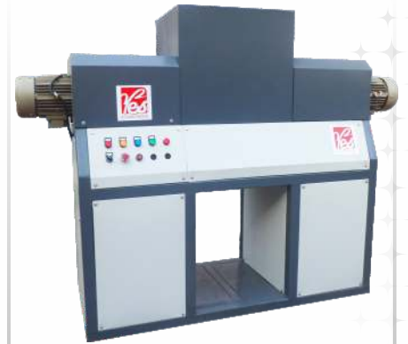
Twin Shaft Shredder 4 to 50 HP