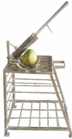
Tender Coconut Punch & Cutting Machine (Stainless Steel)