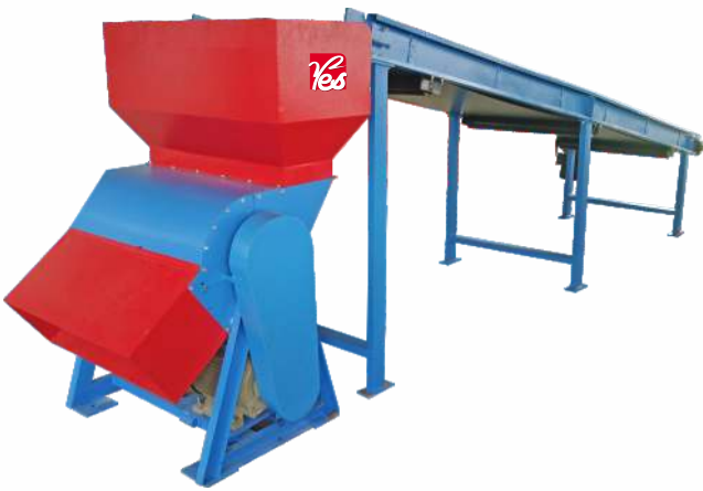
Municipal Solid Waste Shredder 10 / 15 / 20 HP