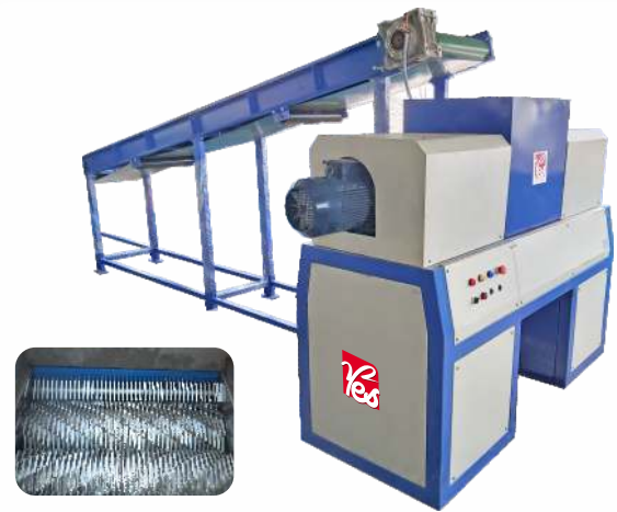
Municipal Solid Waste Shredder (Twin Shaft) 10 to 50 HP