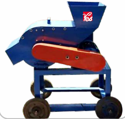
Bio Waste Shredder 3 / 5 / 10 HP