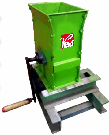
Vegetable Waste Shredder Hand Operated