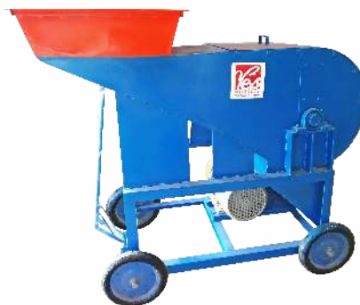
Coconut Husk Waste Shredder 10 / 15 / 20 HP