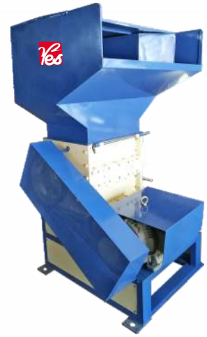
Bio Gas Crusher Machine 5 / 10 / 15 / 20 HP