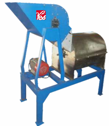
Chicken Waste Shredder 5 / 10 / 15 HP