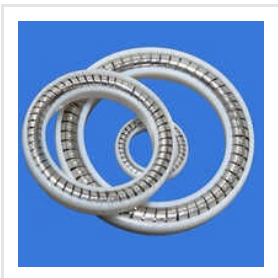
High Grade Spring Energized Lip Seal