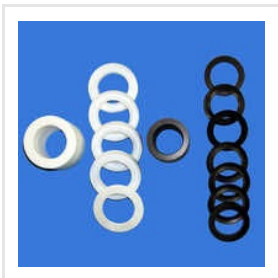
PTFE Chevron Packing Set