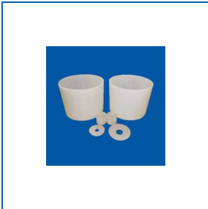
PFA PLUG VALVE SLEEVES

450 Filled Grade Peek Stem Bushing, 450 Filled Grade Peek Thrust Washer, 450g Virgin Peek Tube, Chevron Packing Rubber Seal, Devlon Insert For Floating Valve, High Grade PCTFE Seals, High Grade Spring Energized Lip Seal, Inconel Metal Seals, Industrial Hydraulic Seal, PFA Plug Valve Sleeves, PTFE Butterfly Valve Seat, PTFE Chevron Packing Set, PTFE Diaphragm, PTFE Energized Lip Seal, PTFE General Components, etc.