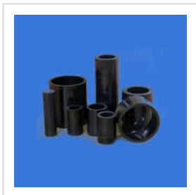
450 Filled Grade Peek Stem Bushing