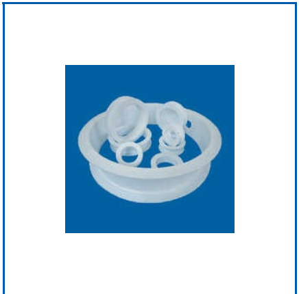
PTFE BUTTERFLY VALVE SEAT