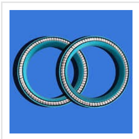
Spring Energized Lip Seal