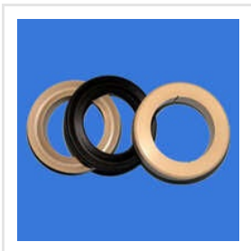
Chevron Packing Rubber Seal