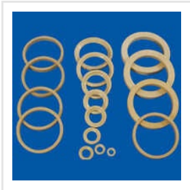
Peek Hydraulic And Pneumatic Seals