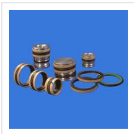
Industrial Hydraulic Seal