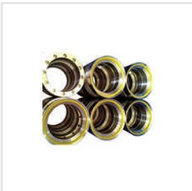
Inconel Metal Seals