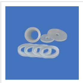
High Grade PCTFE Seals