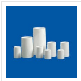
PTFE Plug Valve Sleeves