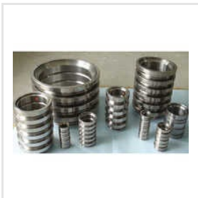
SS316 Metal Seals