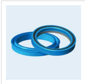
PTFE Hydraulic Seals