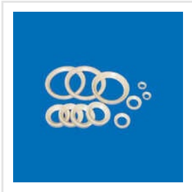
Peek Ball Valve Seal