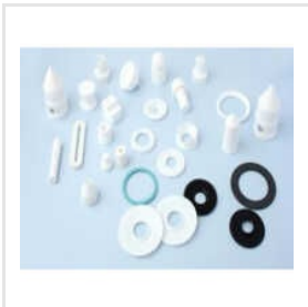
PTFE General Components