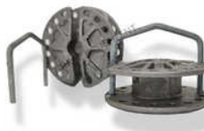
Wire Round Tightner