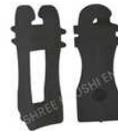
2 Inch Black Hook