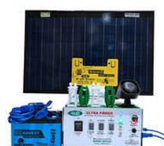
Ultra Power Zatkan Machine