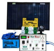
New PCM Turbo Zatkan Machine