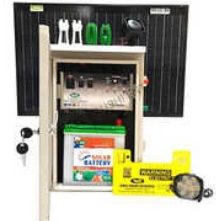
Wall Mount Zatkan Machine