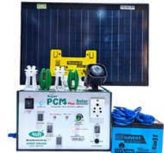
Super PCM Plus Zatkan Machine