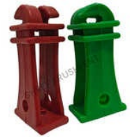
3 Inch HRL Hook