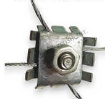
Clutch Wire Joiner