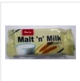
Malt N Milk Glucose Biscuits