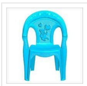
Plastic Baby Chair