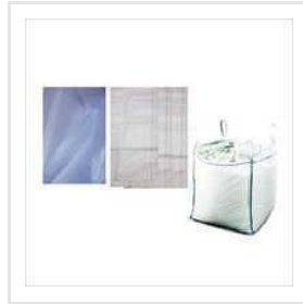
Polypropylene Woven Bags