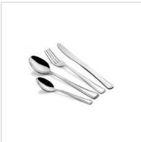
Stainless Steel Cutlery Set