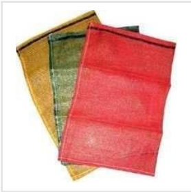
PP Leno Bags