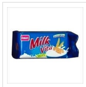
Milk Vita Biscuits