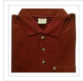
Mens Polo T-Shirt