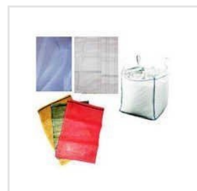
PP Woven Bags