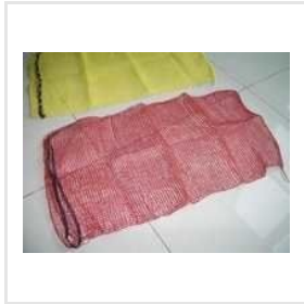
Mesh PP Bags