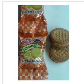
Orange Cream Biscuit