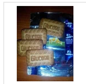
Milk Fresh Glucose Biscuits