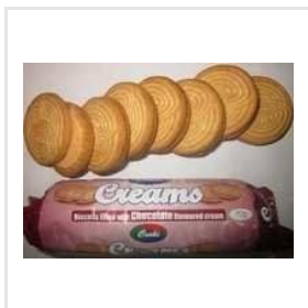
Chocolate Cream Biscuits