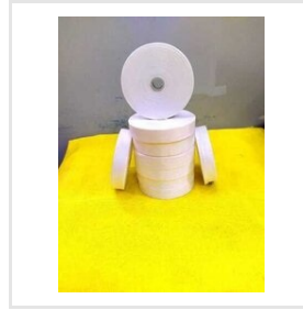
Woven High Shrinkage Polyester Tape