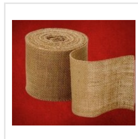
Woven Jute Tape