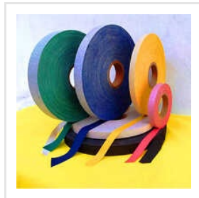
Rubber Coated Tape