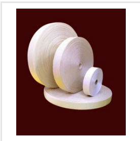
Woven Cotton Tape