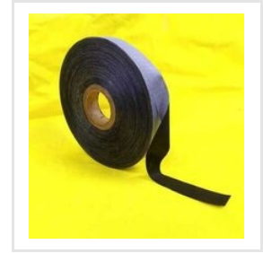
Single And Both Side Black Rubber Coated