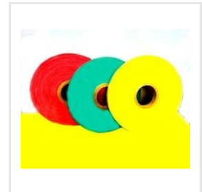
Different Colour Rubber Coated