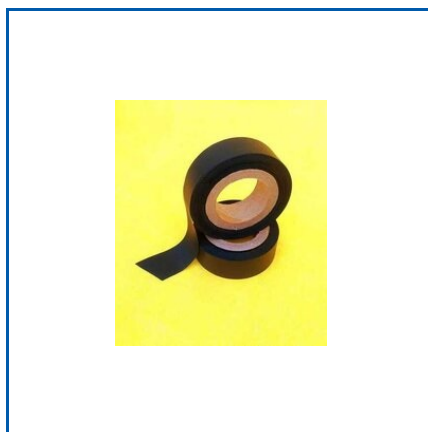
CONDUCTIVE FLEECE TAPE