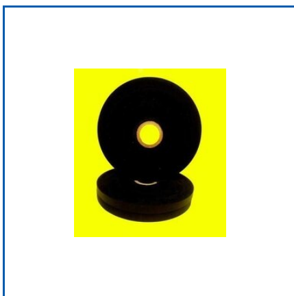
WOVEN SEMICONDUCTIVE TAPE

Black Rubber Coated Cotton Tape, Braided Fiber Glass Cord, Braided Nylon Cord, Braided Polyester Cord, Braided Cotton Cord, Braided Jute Cord, Conductive Fleece Tape, Cord And Rope, Different Colour Rubber Coated Cotton Tape, Different Colour Rubber Coated Synthetic Tape, Double Side White Silicone Rubber Coated Fiber Glass Tape, Electrical Sleeve, FiberGlass Tape, Fire Retardant Fiber Glass Sleeve, Multi Layer Cord, etc.