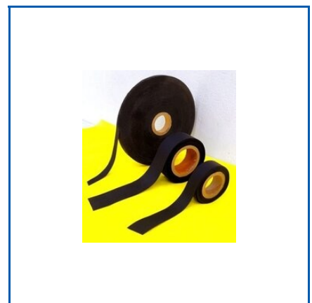
SEMI CONDUCTIVE TAPE