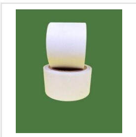
Self Extinguishing Tape