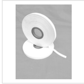
Double Side White Silicone Rubber Coated