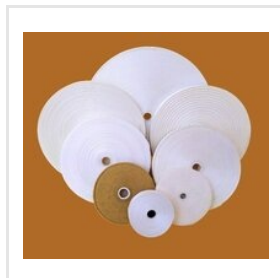
Technical Textile Tape