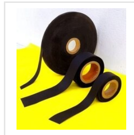
Single And Both Side Black EPR Rubber