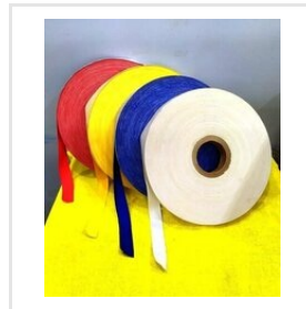
Different Colour Rubber Coated Cotton