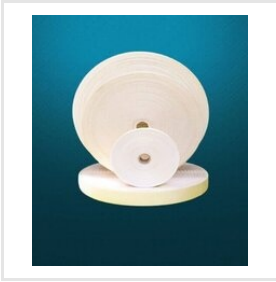
Woven Nylon Tape