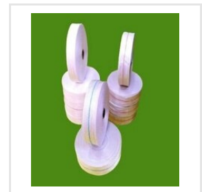
Woven Polyester Tape