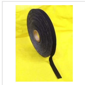
Black Rubber Coated Cotton Tape