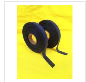
Single And Both Side Black Colour Neoprene