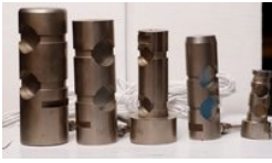
Crane Load Cell