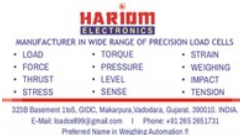
Double Ended Shear Beam Dynamic Load