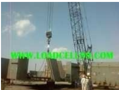
Crane Link Load Cell