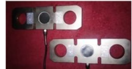
Crane Load Cells