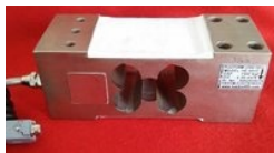
Jumbo Load Cell