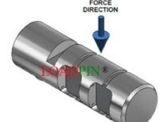
OVERLOAD LIMITING DEVICE LOADPIN