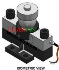
Ball Type Load Cell