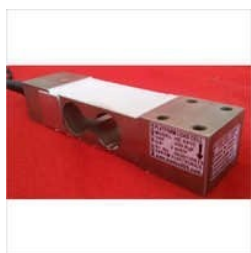
SINGLE POINT PLATFORM LOAD CELLS

Ball Type Load Cell, Batch Controller, Bending Beam Load Cell, Bite Force Sensor, Button Load Cell, Compression Load Cell, Concrete Batch Controller, Conveyor Weigh Unit, Crane Link Load Cell, Crane Load Cell, Crane Load Cells, Double Ended Shear Beam Dynamic Load Cell, Double Ended Shear Beam Load Cells, Force Test Load Cell, Industrial Batch Controller, etc.