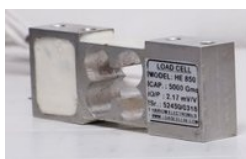
MINIATURE LOAD CELL