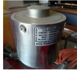
Compression Load Cell