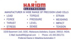
Double Ended Shear Beam Load Cells