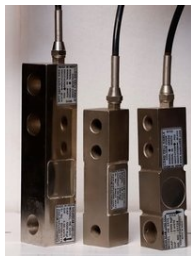
Shear Beam Load Cell