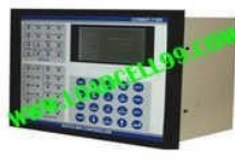
Concrete Batch Controller