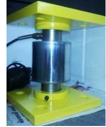
Weighbridge Load Cell