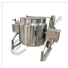
Steam Cooking Vessels