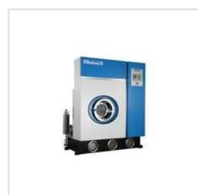
Dry Cleaning Machine