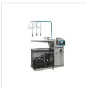
Stain Removing Machines