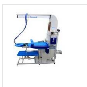
Vacuum Ironing Table