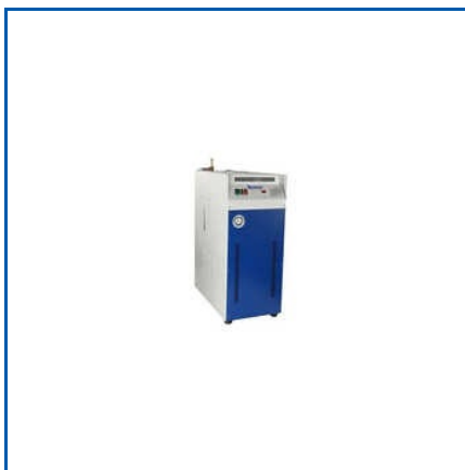
ELECTRICAL STEAM GENERATORS

ACM 20 Automatic Chapati Making Machine, ACM5 Compact Automatic Chapati Making Machine, ALTO SHAAM - 1000-UP DOUBLE COMPARTMENT HOLDING CABINET, ALTO SHAAM 1200-UP HIGH VOLUME DOUBLE COMPARTMENT HOLDING CABINET, Adjustable Dish Caddies, Air Hose Reel Heavy Duty Auto Retractable, Automatic Hand Sanitizer Dispenser, Back Bar Chiller, Bain Marie With Sneeze Guard, Bakery Trolley, Beverage Coolers, Black Back Bars, Blast Chillers And Shock Freezers, Bulk Rice Cooker, CP10 Chapati Pressing Machine, etc.