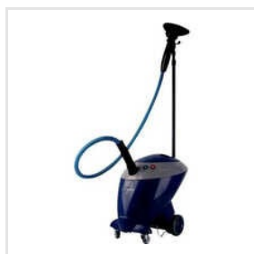
Cocoon Garment Steamer