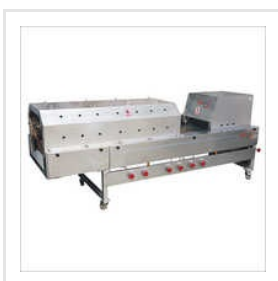
Industrial Automatic Chapati Making