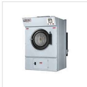
Industrial Tumble Dryers