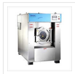
Front Loading Washer Extractor Machine