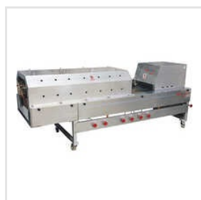
ACM 20 Automatic Chapati Making