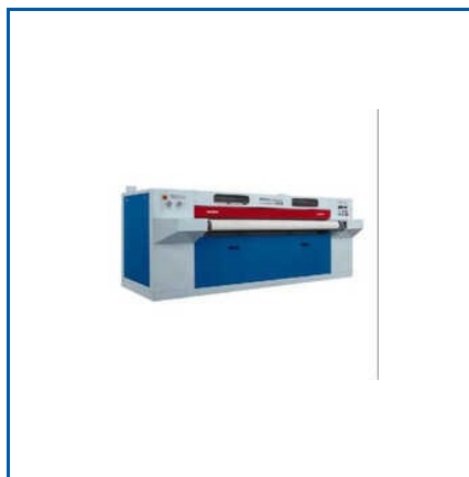
FLAT WORK IRONERS