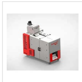
ACM5 Compact Automatic Chapati