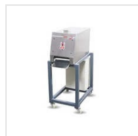
CP10 Chapati Pressing Machine