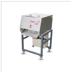
CP20 Chapati Pressing Machine