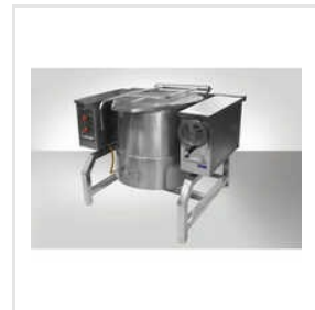
Tilting Frying Pan-Electric And Gas