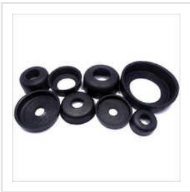
Leather Cup Seals