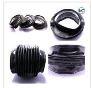
Foam Leather Bellows