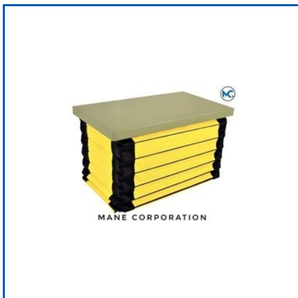
SCISSOR LIFT BELLOW

Aluminized glass fabric bellows, Axial Bellow, Ball screw Bellows, Bellow Cover, Bosch Rexroth Bellow Covers, Bystronic Fiber Laser Machine Bellow Cover, CNC Bellow, Canvas Bellows, Chrome Leather Gasket, Chrome Leather Washer, Circular Bellows, Cylinder Rod Bellows, Fabric Bellow, Flat Bellows, Foam Leather Bellows, etc.