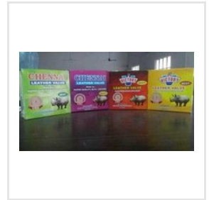
Hand Pump Leather Washer