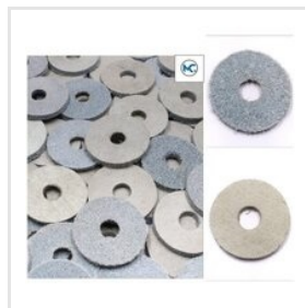
Chrome Leather Washer