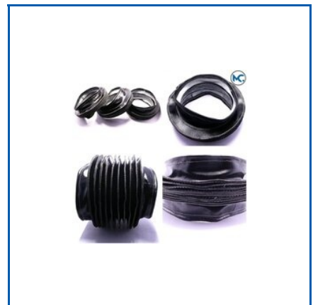
LEATHER FLEXIBLE BELLOWS