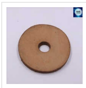
Leather Flat Washer