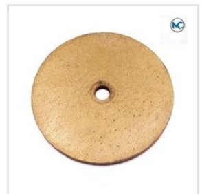
Round Leather Washer