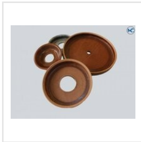
Leather Cup Seal