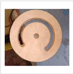
Leather Valve Washer