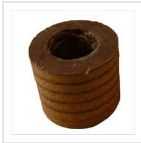
Leather Coupling Washer