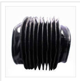
Industrial Leather Bellows