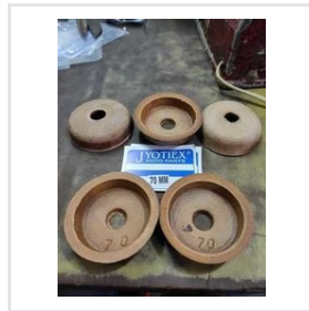
Leather Hydraulic Bucket