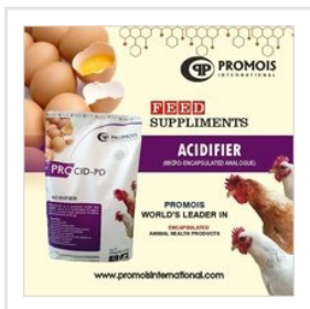
Acidifier For Poultry