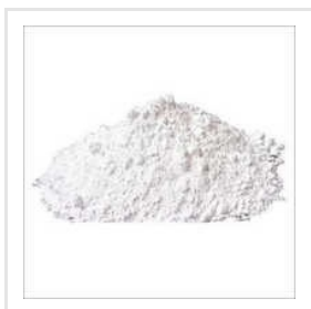
Arginine Amino Acid Powder