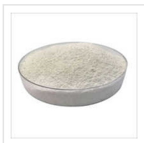
Betaine HCL Powder