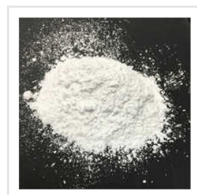
L Glutamine Powder