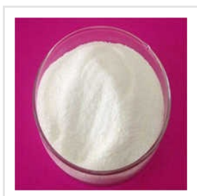
L Valine Feed Grade Powder