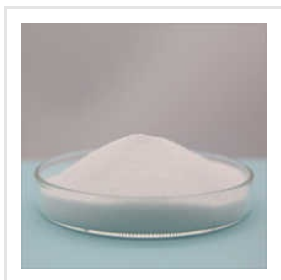
Glutamic Acid Powder