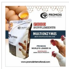
Enzymes For Poultry