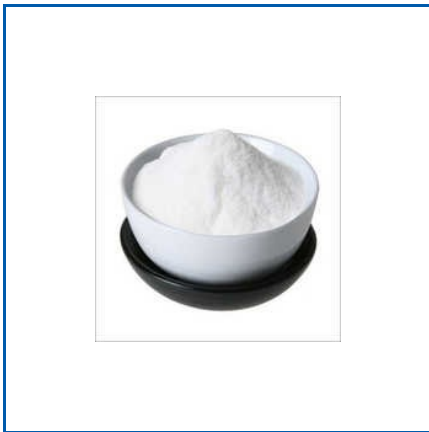
D ALANINE POWDER

Acidifier for poultry, Amoxicilline (Analogue), Arginine Amino Acid Powder, Azithromycin powder, Betaine HCL Powder, Cephalexine (Analogue), Chlortetracycline CTC, Choline Chloride, Closantel (Analogue), etc.