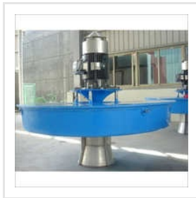
Automatic Surface Aerators