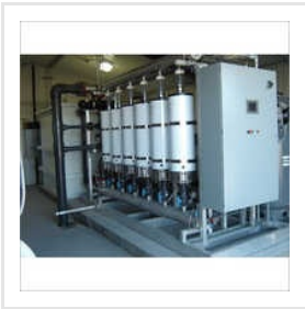
Industrial Ultrafiltration Plant