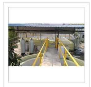
Industrial Effluent Treatment Plant