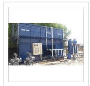
Automatic Industrial Sewage Treatment