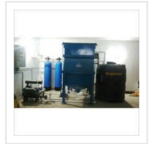
Industrial Tube Settler System