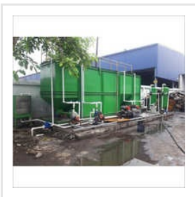
Prefabricated Sewage Wastewater Treatment