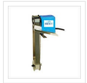
Industrial Oil Skimmer