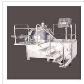
Automatic Rapid Mixer Granulator