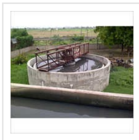
Dairy Effluent Treatment Plant