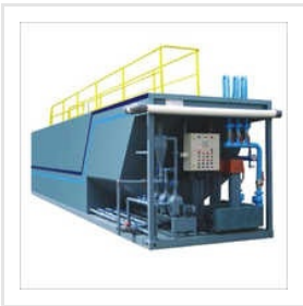
Containerized Effluent Treatment Plant