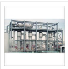
Industrial Multi Effect Evaporators