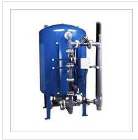
Industrial Activated Carbon Filter