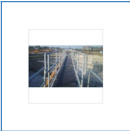
INDUSTRIAL SEWAGE TREATMENT PLANT

Automatic Industrial Sewage Treatment Plant, Automatic Rapid Mixer Granulator, Automatic Sewage Water Treatment Plant, Automatic Surface Aerators, Compact Sewage Treatment Plant, Containerized Effluent Treatment Plant, Dairy Effluent Treatment Plant, etc.