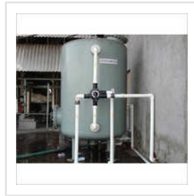
Industrial Dual Media Filter