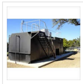
Packaged Effluent Treatment Plant