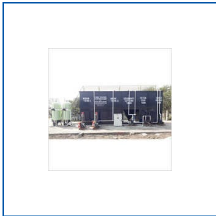
COMPACT SEWAGE TREATMENT PLANT