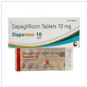
10mg Dapagliflozin Tablets