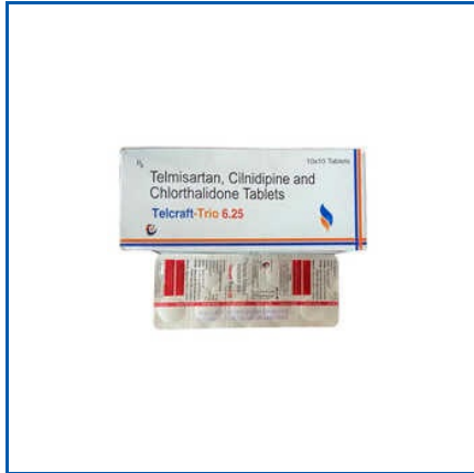
TELCRAFT-TRIO 6.25 TELMISARTAN CILNIDINE AND CHLORTHALIDONE TABLETS