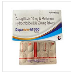
Dapagliflozin 10mg And Metformin