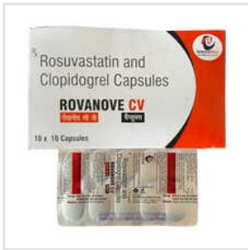
Rosuvastatin And Clopidogrel Capsules