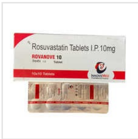
10mg Rosuvastatin Tablets IP