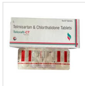
Telmisartan And Chlorthalidone Tablets