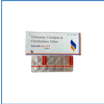
TELMISARTAN CILNIDIPINE AND CHLORTHALIDONE TABLETS