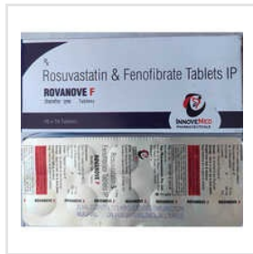
Rosuvastatin And Fenofibrate Tablets IP