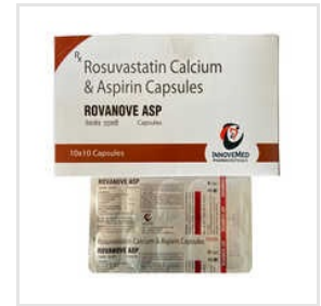
Rosuvastatin Calcium And Capsules