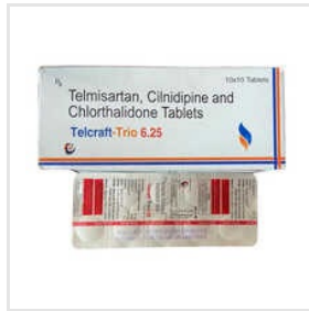
Telcraft-Trio 6.25 Telmisartan Cilnidine