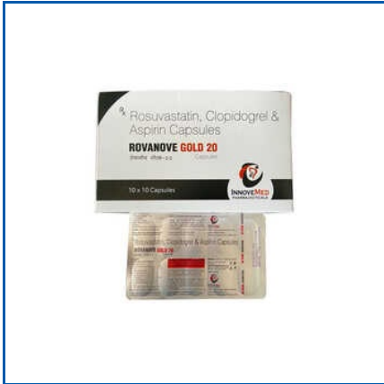
ROSUVASTATIN CLOPIDOGREL AND CAPSULES

10mg Dapagliflozin Tablets, 10mg Rosuvastatin Tablets IP, 20mg Rosuvastatin Calcium Tablets IP, 50mg Vildagliptin Tablets IP, Curcumin Collagen Peptide Vitamin C Sodium Hyaluronate And Chondroitin Tablets, etc.