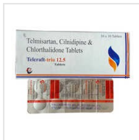
Telmisartan Cilnidipine And Chlorthalidone