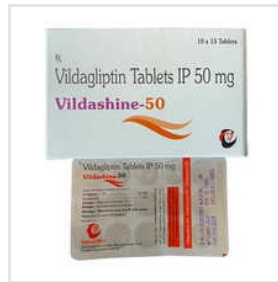
50mg Vildagliptin Tablets IP