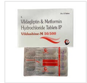
Vildagliptin And Metformin