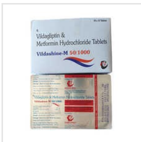
Vildagliptin And Metformin