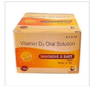
Vitamin D3 Oral Solution