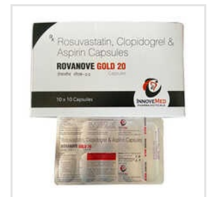
Rosuvastatin Clopidogrel And