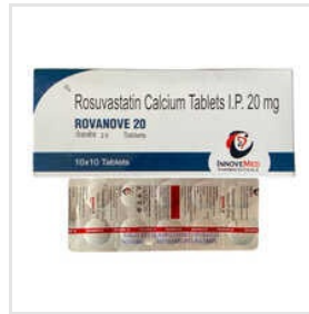
20mg Rosuvastatin Calcium Tablets IP