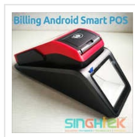
Billing Android Smart POS Machine For Wine