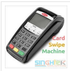
ATOM Card Swipe Machine