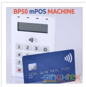
AGS Ongo MPOS Swipe Machine