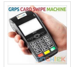
Ingenico Pine Labs Card Swipe Machine