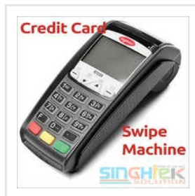
Credit Card Swipe Machine