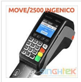
Ingenico Move2500 POS Machine