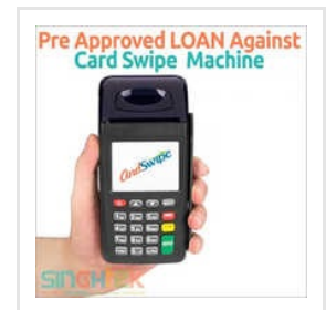
Pre Approved Loan Against Card Swipe