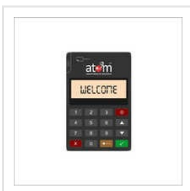
MPOS Card Swipe Machine