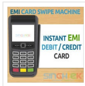
Swipe Credit Card EMI Machine