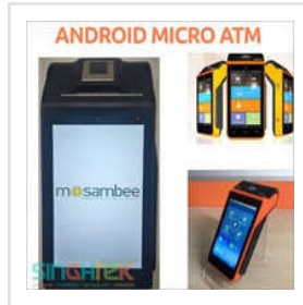
MF919 Mosambee Android Micro ATM