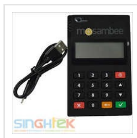
Mosambee Micro ATM Swipe Machine