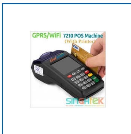
ANDSWIPE L7210 GPRS CARD SWIPE MACHINE