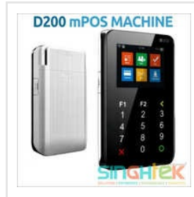
D200 MPOS Card Swipe Machine