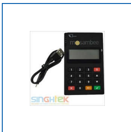
MOSAMBEE MPOS MACHINE

AGS Ongo White Label ATM Machine, AGS Ongo mPOS Swipe Machine, ATM And Cash Deposit Machine, ATOM Card Swipe Machine, AndSwipe A9210 Smart POS Terminal, AndSwipe Android EDC POS Terminal, AndSwipe L7210 GPRS Card Swipe Machine, AndSwipe Micro ATM Machine, Aratek A600 Biometric Fingerprint Scanner, Billing Android Smart POS Machine For Wine Shop, Credit Card Swipe Machine, etc.