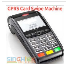
GPRS Card Swipe Machine