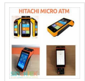
Hitachi Mini ATM Machine