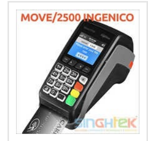
Move 2500 4G EDC Machine