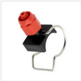
Axial Cone Clip On Spray Nozzle