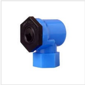
Hollow Cone Spray Nozzle Assembly For