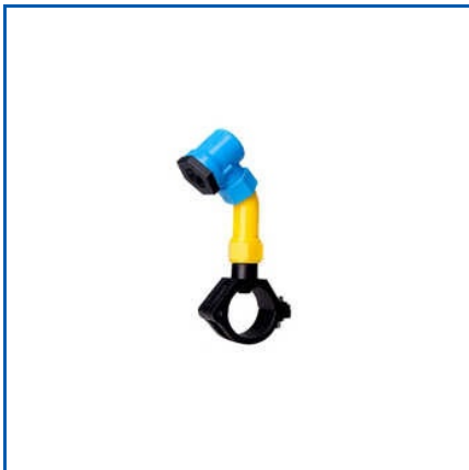
PLASTIC SPRAY NOZZLE FOR SPRAY BATH

Adjustable Ball Joint Spray Nozzles for PT Line, Adjustable Coolant Modular Pipe Spray Nozzles, Axial Cone Clip On Spray Nozzle, Axial Flow Full Cone Jet Nozzle, Axial Full Cone Spray Nozzle Assembly, Brake Liner for Sulzer TW11 PU Looms, Clip Eyelet Clamps, etc.