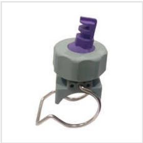
Water Curtain Flood Nozzle