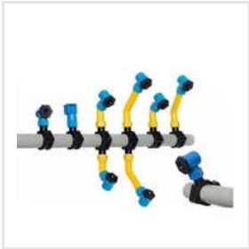
Industrial Spray Nozzle