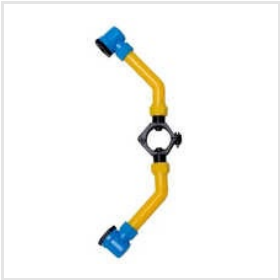
Water Cooling Bath Spray Nozzles