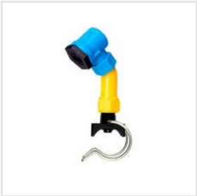
SS Spring Clip Quick Fit Spray Nozzles