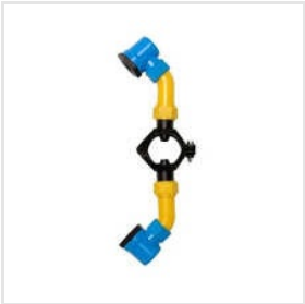
Pipe Extruder Tank Spray Nozzle