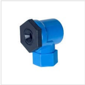
Hollow Cone Spray Nozzles