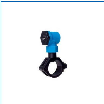
HOLLOW CONE SPRAY NOZZLE ASSEMBLY