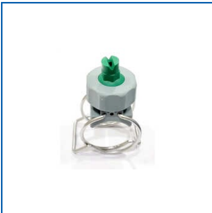
ADJUSTABLE BALL JOINT SPRAY NOZZLES FOR PT LINE