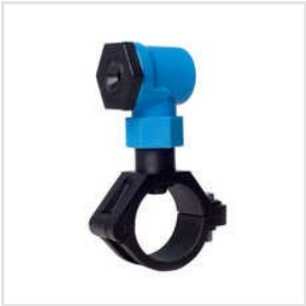
Pipe Extrusion Vacuum Cooling Tanks Spray