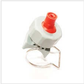
PT Pretreatment Line Phosphating Spray