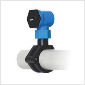
Water Spray Nozzle