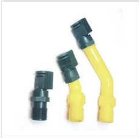
Solar Sprinkler Nozzle