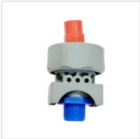
Industrial Spray Threaded Nozzle