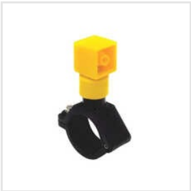
Spray Nozzle For Pipe Extrude Cooling Tank