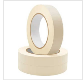
Abro Masking Tapes