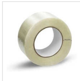
Single Side Mono Filament Tape