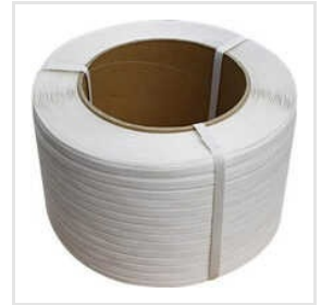
Plain Box Strapping Roll