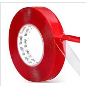
Red Polyester Tape