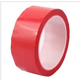
Mylar Polyester Tape