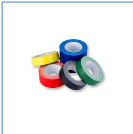
BOOK BINDING TAPE