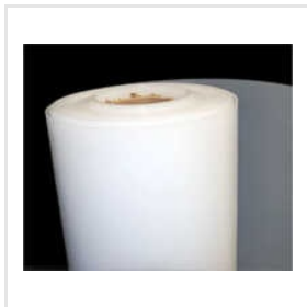
Ldpe Tubing Roll