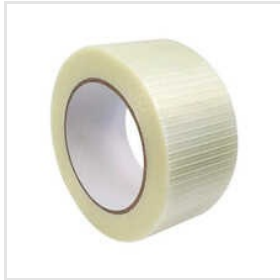
Double Side Cross Filament Tape