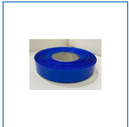
PVC BUSBAR HEAT SHRINK SLEEVE