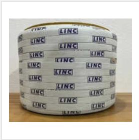
Printed Box Strapping Roll