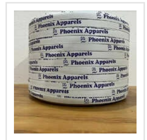
Printed PP Strapping Roll