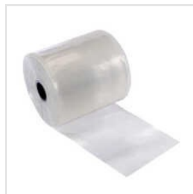
Plastic Pepsi Tube Roll