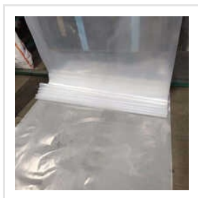
Ldpe Tubes Sheet Rolls