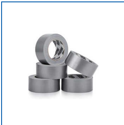
GREY DUCT TAPE

Abro Masking Tapes, Aluminium Foil Plain Tape, Aluminium Tape Without Liner, Book Binding Tape, Bopp Printed Packaging Tape, Brown BOPP Self Adhesive Tape, Colored Stretch Wrap Film, Coloured Stretch Film, Cryovac Polyolefin Shrink Film, Custom Printed Bopp Packaging Tapes, Double Side Cross Filament Tape, Double Side Eva Foam Tape, Double Sided Pvc Tape, Double Sided Tape, Dry Wall Tape, etc.