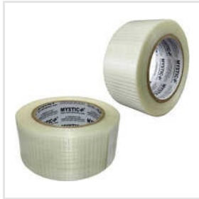
Single Side Cross Filament Tape