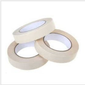
Paper Masking Tape