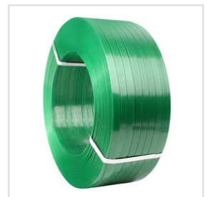
Packaging PET Strap