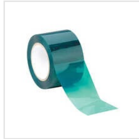
Green Polyester Tape