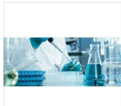
Pharma Franchise In West Bengal