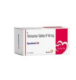
Spedotel 40 MG