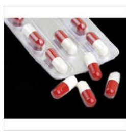
Allopathic PCD Pharma Franchise In Barpeta