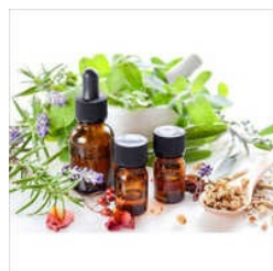
HERBAL PCD PHARMA FRANCHISE