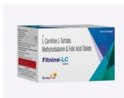
FITNINE - LC

1 ml Vancomycin Infection Injection, 100 ml Dextromethorphan HBr and Chlorpheniramine Maleate Syrup, 200 mg Amoxycyclav Infection Dry Syrup, 250 mg Ciprofloxacin Infection Tablet, 30 ml Amoxycyclav Safe Infection Dry Syrup, 400 mg S-Adenosyl L-Methione Tablet, 50 ml Dextromethorphan HBR and Chlorpheniramine Maleate Syrup, 500 mg Ciprofloxacin (Zydus) Infection Tablet, 500 mg Ciprofloxacin Infection Tablet, 500 mg Vancomycin CP Infection Injection, 550 mg Rifaximin Tablet, 60 mg Artesunate for Injection, Aceclofenac & Paracetamol Suspension, Aceclofenac - Paracetamol & Serratiopeptidase Tablets, Aceclofenac - Paracetamol and Serratiopeptidase Tablets, etc.