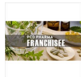
AYURVEDIC PCD PHARMA FRANCHISE