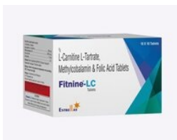
Fitnine - Lc