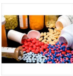
Neuropsychiatry PCD Pharma Franchise