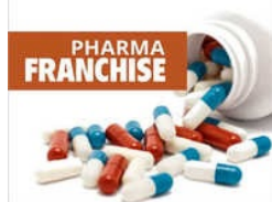
Allopathic PCD Pharma Franchise