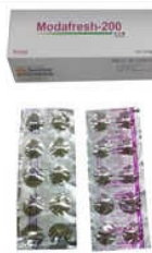
Modafresh 200 Tablets