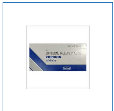
7.5 MG ZIPICLONE IP TABLETS