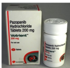
Votrient 200mg Tablet (Pazopanib (200mg))