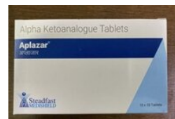
Aplazar Tablet (Alpha Ketoanalogue