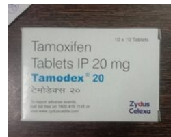
Tamodex 20 Mg Tablet