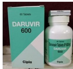
Daruvir 600 R Tablet (Darunavir And