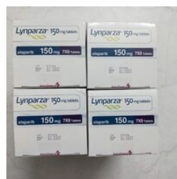
Olaparib 150mg Tablet