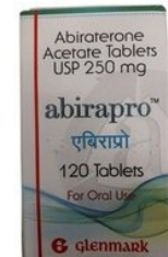
Abirapro 250mg Tablet