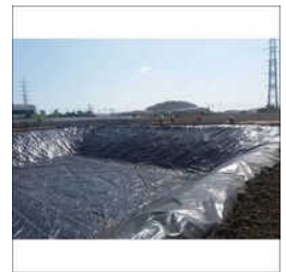
Hdpe Pond Liners Fabric