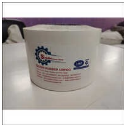
Waterproof Self Adhesive Tape