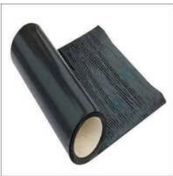
APP Bitumen Membrane