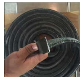
HYDROPHILIC SWELLABLE WATER BAR