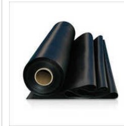
EPDM Waterproofing Membrane