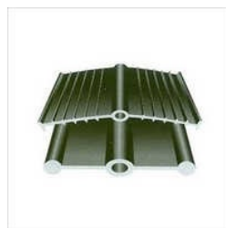
INDUSTRIAL PVC WATER STOP SEAL