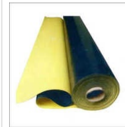
UPVC Waterproofing Membrane