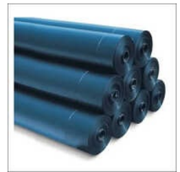
HDPE Geomembrane Sheet