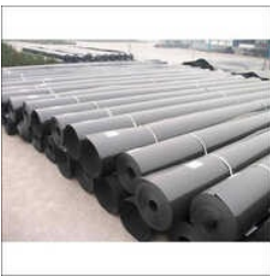
Hdpe Membrane 250 Micron 700 Micron