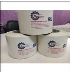
Water Profing Double Sided Tape