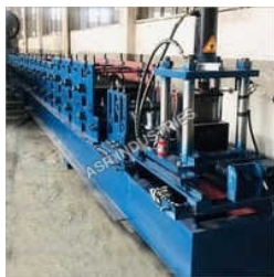
DIN RAIL ROLL FORMING MACHINE

Automatic Color Coated Sheet Roll Forming Machine, Automatic Sheet Roll Forming Machine, C & Z Purlin Roll Forming Machine, C Purlin Roll Forming Machine, Coated Roofing Sheet Making Machine, Colour Coated Sheet Roll Forming Machine, Corrugated Roll Forming Machine, Corrugated Roof Sheet Roll Forming Machine, etc.