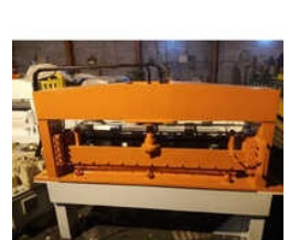
Trapezoidal Roof Roll Forming Machine