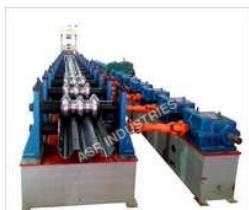
Highway Guardrail Roll Forming Machine