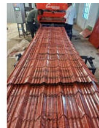
TILE PROFILE ROLL FORMING MACHINE