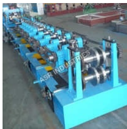
C & Z Purlin Roll Forming Machine