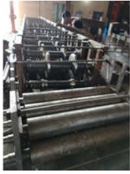
C Purlin Roll Forming Machine