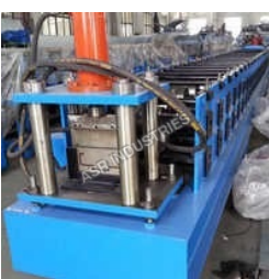
Door Frame Roll Forming Machine