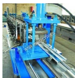
Rolling Shutter Roll Forming Machine