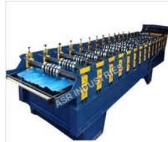
Corrugated Roll Forming Machine