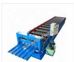
Trapezoidal Roof Sheet Roll Forming Machine