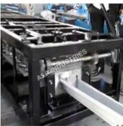
Gutter Roll Forming Machine