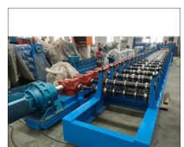
Guardrail Crash Barrier Roll Forming Machine