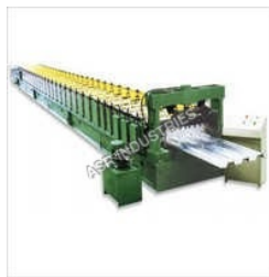
DECK SHEET ROLL FORMING MACHINE