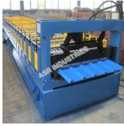
Colour Coated Sheet Roll Forming Machine