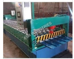
Roofing Roll Forming Machine