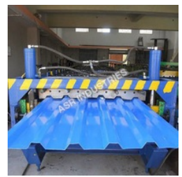
Industrial Coated Roofing Sheet Forming Machine