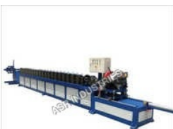
Unistrut Channel Roll Forming Machine