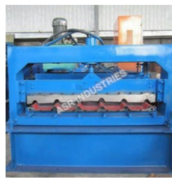
Metal Roofing Sheet Forming Machine