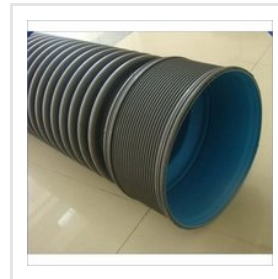
Id 150 Mm Dwc Construction Sewage