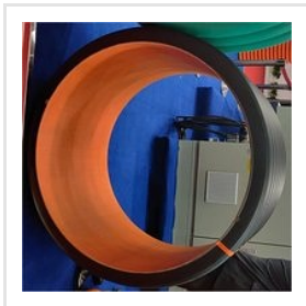
ID 600 Mm DWC Pipe