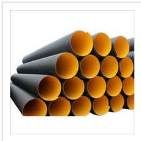
OD 200 Mm DWC Pipe