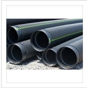
OD 180 Mm Sewage DWC Pipe