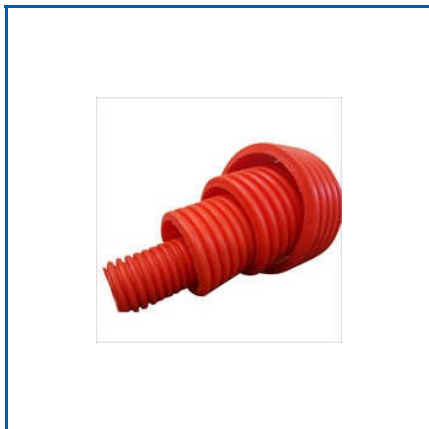
HDPE DOUBLE WALLED CORRUGATED PIPES

110 MM Conduit DWC Pipe, 600 MM Double Wall Corrugated Pipe, HDPE DWC Drain Pipe, HDPE Double Walled Corrugated Pipes, ID 200 MM Sewage DWC Pipe, ID 200 mm Sewage DWC Pipe, ID 400 mm DWC Pipe, ID 500 mm Sewage DWC Pipe, ID 600 mm DWC Pipe, Id 150 Mm Dwc Construction Sewage Pipe, Id 250 Mm Dwc Pipe, Id 300 Mm Dwc Pipe, OD 160 mm Drainage DWC Pipe, OD 180 mm Sewage DWC Pipe, OD 200 mm DWC Pipe, etc.