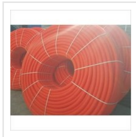
OD 40 Mm DWC Pipes Electrical