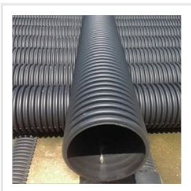
OD 160 Mm Drainage DWC Pipe