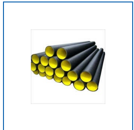
OD 250 MM DWC PIPE