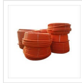
OD 50 Mm DWC Pipe Electrical