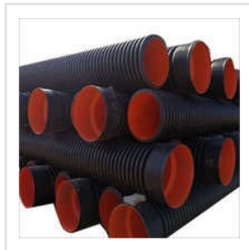
OD 315 Mm DWC Pipe