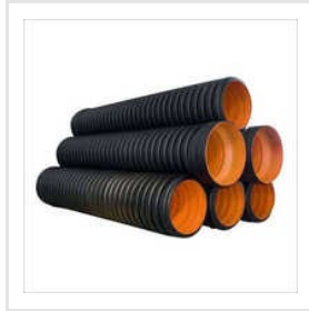
Id 300 Mm Dwc Pipe