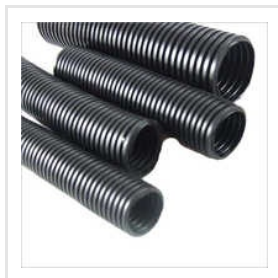
Id 250 Mm Dwc Pipe