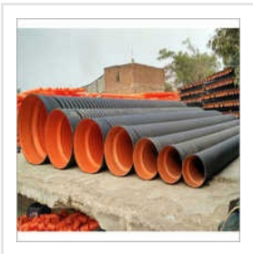
Round Double Wall Corrugated Pipes