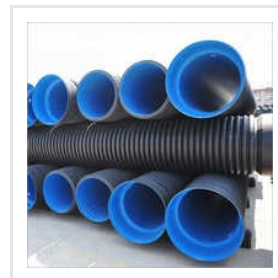
ID 400 Mm DWC Pipe