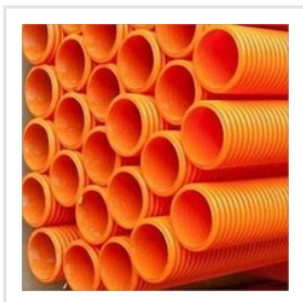
Od 120 Mm Dwc Pipe