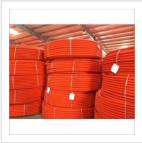
OD 63mm DWC Pipe