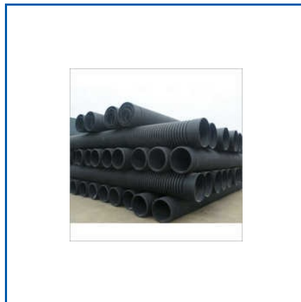
HDPE DWC DRAIN PIPE