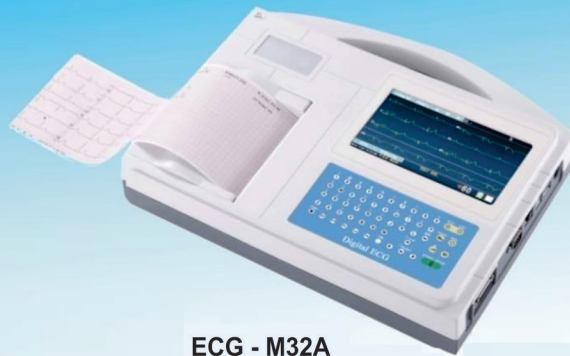
ECG - M32A