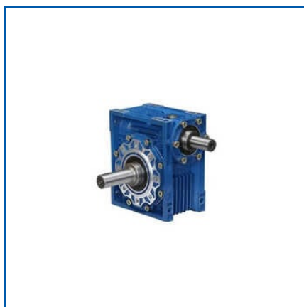
ZTW SISO WORM REDUCTION GEARBOX