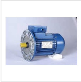
Flange Mounted ZTS Electric Motor