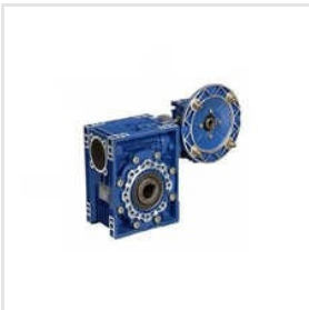
ZTG Double Step Worm Reduction Gearbox