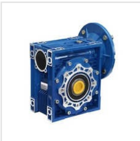
ZTG Hollow Input Hollow Output Worm