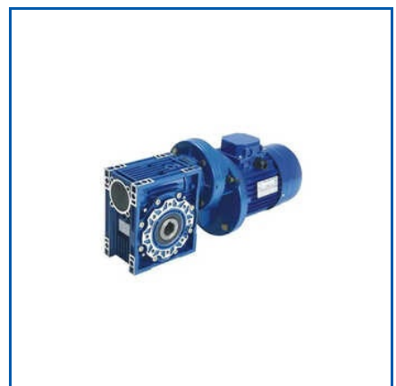
ZTP HELICAL REDUCTION GEARBOX