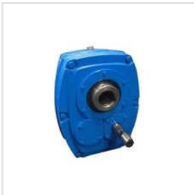
MS Shaft Mounted Speed Reducer