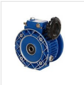
ZTMV - Mechanical Speed Variator