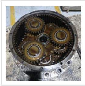
Planetary Gearbox Repair Service