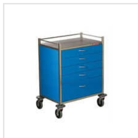
Stainless Steel Medicine Trolley