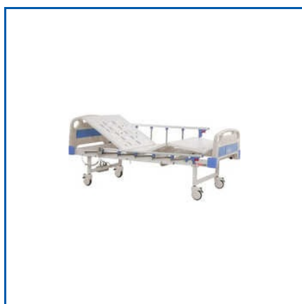
ELECTRIC HOSPITAL FOWLER BED

3 Function Electric Bed, 3 Function Hospital ICU Bed, 32x24x37 Inch Iron And Steel Wheelchairs, Comfortable Executive Chair, Comfortable Visitor Chair, Electric Dialysis Chair, Electric Examination Table, Electric Hospital Fowler Bed, Electric Veterinary Table, Emergency Crash Cart Trolley, Emergency Stretcher Trolley, Examination Couch With Backrest, Gynaec Examination Table, Height Adjustable Overbed Table, Hospital Bed Mattress, etc.