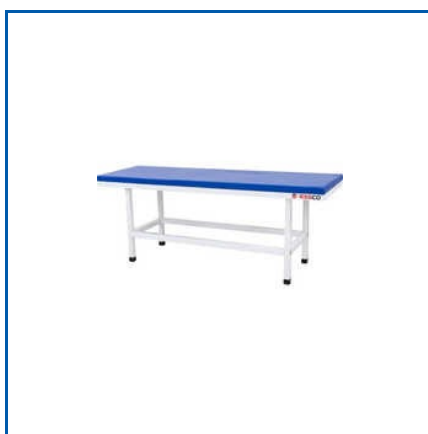
PATIENT ATTENDANT BED