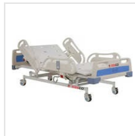
Mild Steel Movable ICU Bed