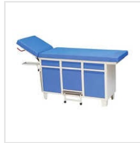
Examination Couch With Backrest