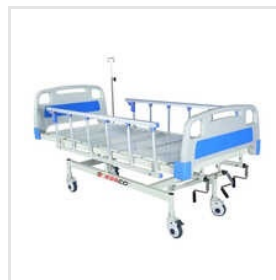
3 Function Hospital ICU Bed