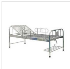
Semi Fowler Hospital Bed