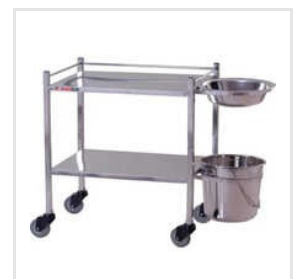
Stainless Steel Instrument Trolley