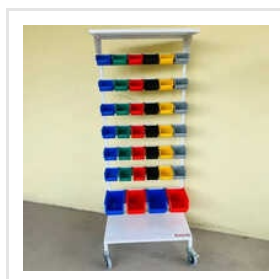
Medical Drug Trolleys