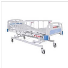
3 Function Electric Bed