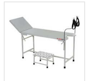
Gynaec Examination Table