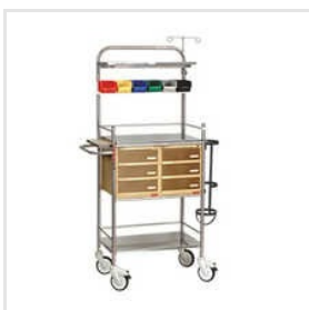
Emergency Crash Cart Trolley