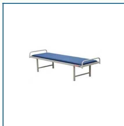
MILD STEEL ATTENDANT BED