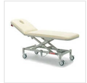
Electric Examination Table