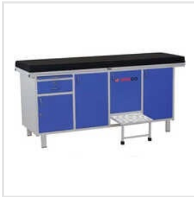
Single Drawer Examination Table