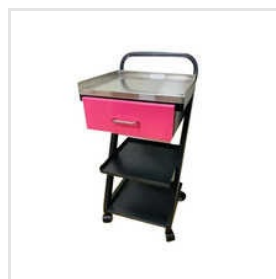
Mild Steel ECG Trolley