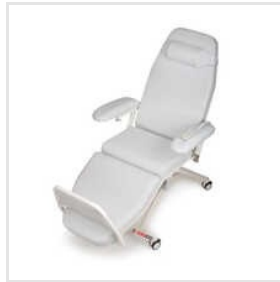
Electric Dialysis Chair