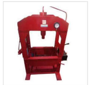
Hydraulic Hand Operated Press