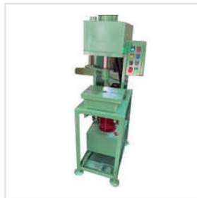
Hydraulic C Frame Press Machine