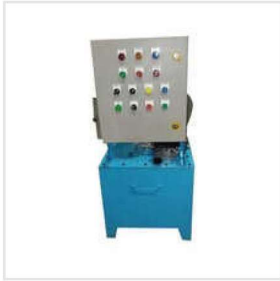
Industrial Hydraulic Power Pack