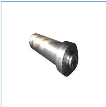
HYDRAULIC HIGH PRESSURE CYLINDER

10 T Tie Rod Hydraulic Cylinder, 2 HP Hydraulic Power Pack, 400 Bore Flange Mounting Hydraulic Cylinder, 50 T Hydraulic Press Machine, 500 Bore Flange Mounting Hydraulic Cylinder, 7 T Hydraulic Rotary Cylinder, 8 T Tie Rod Hydraulic Cylinder, Double Acting Hydraulic Cylinder, Horizontal Hydraulic Hose Crimping Machine, etc.