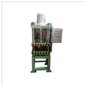
50 T Hydraulic Press Machine