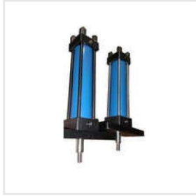
10 T Tie Rod Hydraulic Cylinder