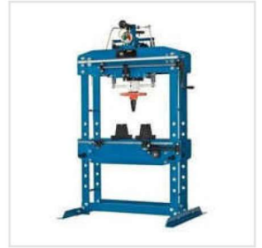
Hydraulic Manual Press Machine