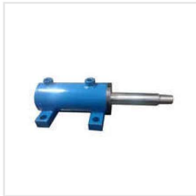
Hydraulic Foot Mounting Cylinder