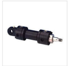
500 Bore Flange Mounting Hydraulic