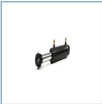
INDUSTRIAL HYDRAULIC CYLINDERS