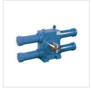
7 T Hydraulic Rotary Cylinder