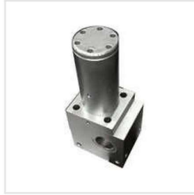
Hydraulic Rotary Cylinder