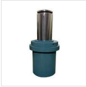
400 Bore Flange Mounting Hydraulic