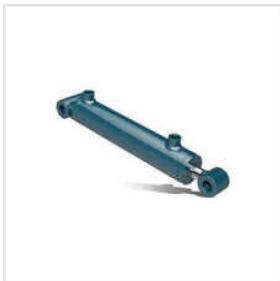
Double Acting Hydraulic Cylinder