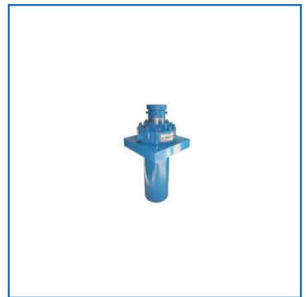
HYDRAULIC PRESS CYLINDER