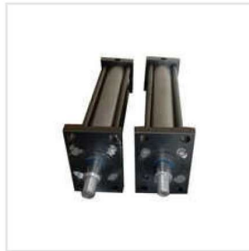
8 T Tie Rod Hydraulic Cylinder