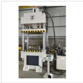
Hydraulic Deep Drawing Press Machine