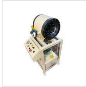
Horizontal Hydraulic Hose Crimping