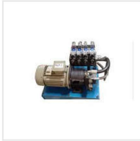
2 HP Hydraulic Power Pack