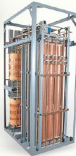
Inner view of Stabilizer