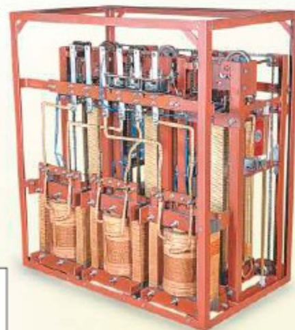
Inner View of Unbalanced Stabilizer

*We manufacture machines as per customer's requirements