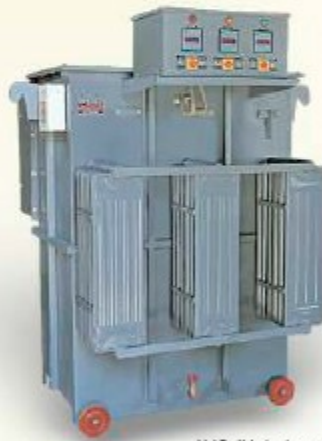
AVC (Unbalanced Type)