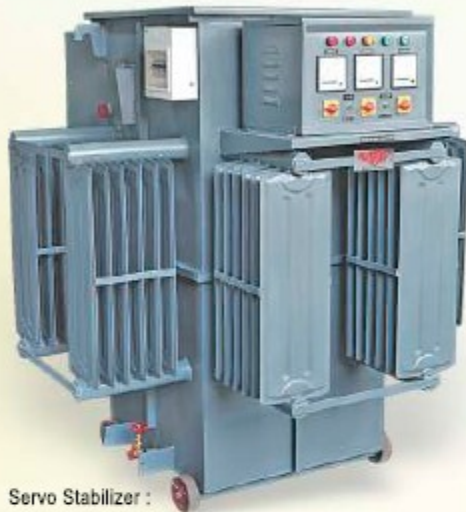
Servo Stabilizer : Upto 5000 KVA