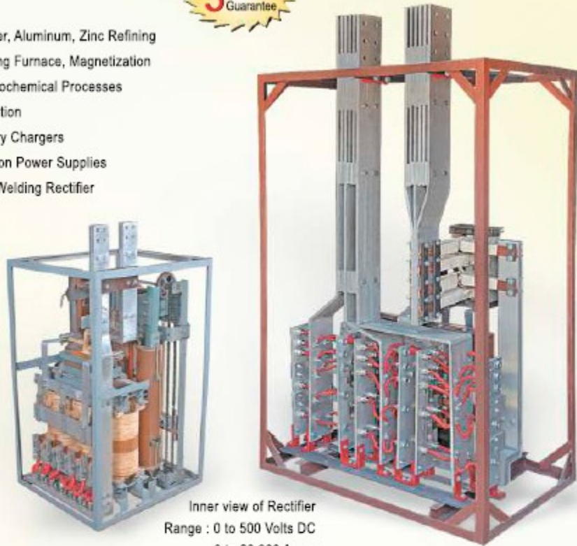
Inner view of Rectifier Range : 0 to 500 Volts DC 0 to 20,000 Amps