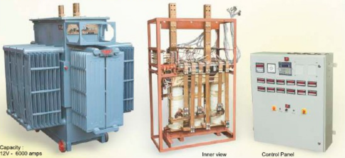
Capacity : 12V - 6000 amps