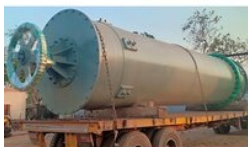
Fabricated Shell And Heat Exchanger Frame