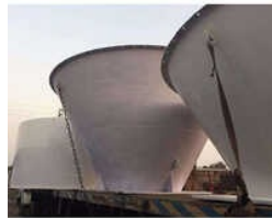
Chute For Bharat Cooking Coal