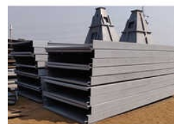
Fabricated Steel Beam