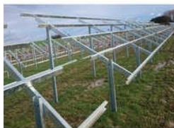
PILE SOLAR STRUCTURE