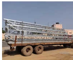
Sub Station Structure