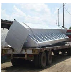
Furnace Kiln Beam