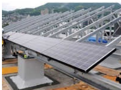
GROUND MOUNTED SOLAR PANEL STRUCTURE

Chute For Bharat Cooking Coal, Commercial Solar Trackers, Commercial Water Tank Solar Structure, Dryer For Bhushan Steel, Dryer For Jindal Steel, Fabricated Dust Collector Hopper, Fabricated Emitting Suspension Frames, Fabricated Shell And Heat Exchanger Frame, Fabricated Steel Beam, Fabricated Structure Steel, Fabricated Top Beam, Furnace Kiln Beam, Ground Mounted Solar Panel Structure, Hooper Fabrication Services, Industrial Fabricated Tanks And Kettles, etc.