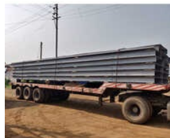
Fabricated Top Beam