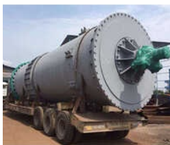
Dryer For Jindal Steel