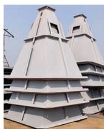
Fabricated Dust Collector Hopper