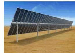
COMMERCIAL SOLAR TRACKERS