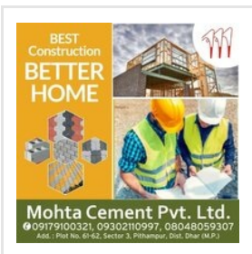
Concrete Blocks And Bricks