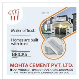
Rectangular Grey Fly Ash Bricks For Side