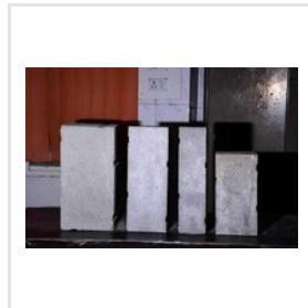
Building Bricks And Blocks