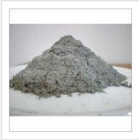
Fine Fly Ash