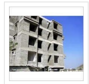
Concrete ECO Bricks