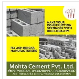
Eco Friendly Fly Ash Blocks