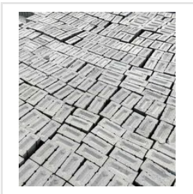
Light Fly Ash Bricks