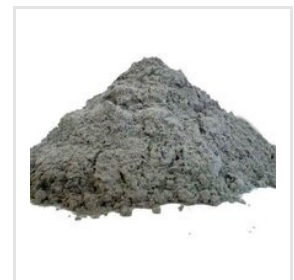
Premium Fly Ash