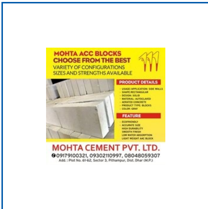
HIGH QUALITY ACC BLOCKS

AAC Block, ACC Blocks, Best Construction Material, Best Eco- Friendly Concrete Blocks and Fly Ash Bricks, Best Flyash Bricks, Best Quality Fly Ash Bricks, Best Quality Kerb Stone, Bricks and Blocks, Building Bricks and Blocks, Cement, Cement Bricks, Cemented Bricks, Cemented Concrete Blocks, Concrete Block, Concrete Blocks, etc.