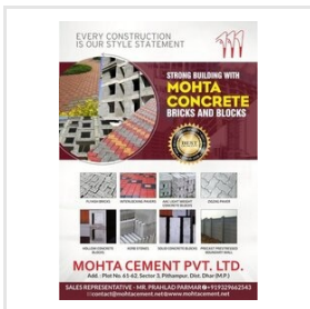
Bricks And Blocks