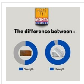
Flyash Bricks Vs Clay Bricks