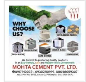
Best Construction Material