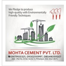
Best Eco- Friendly Concrete Blocks And Bricks